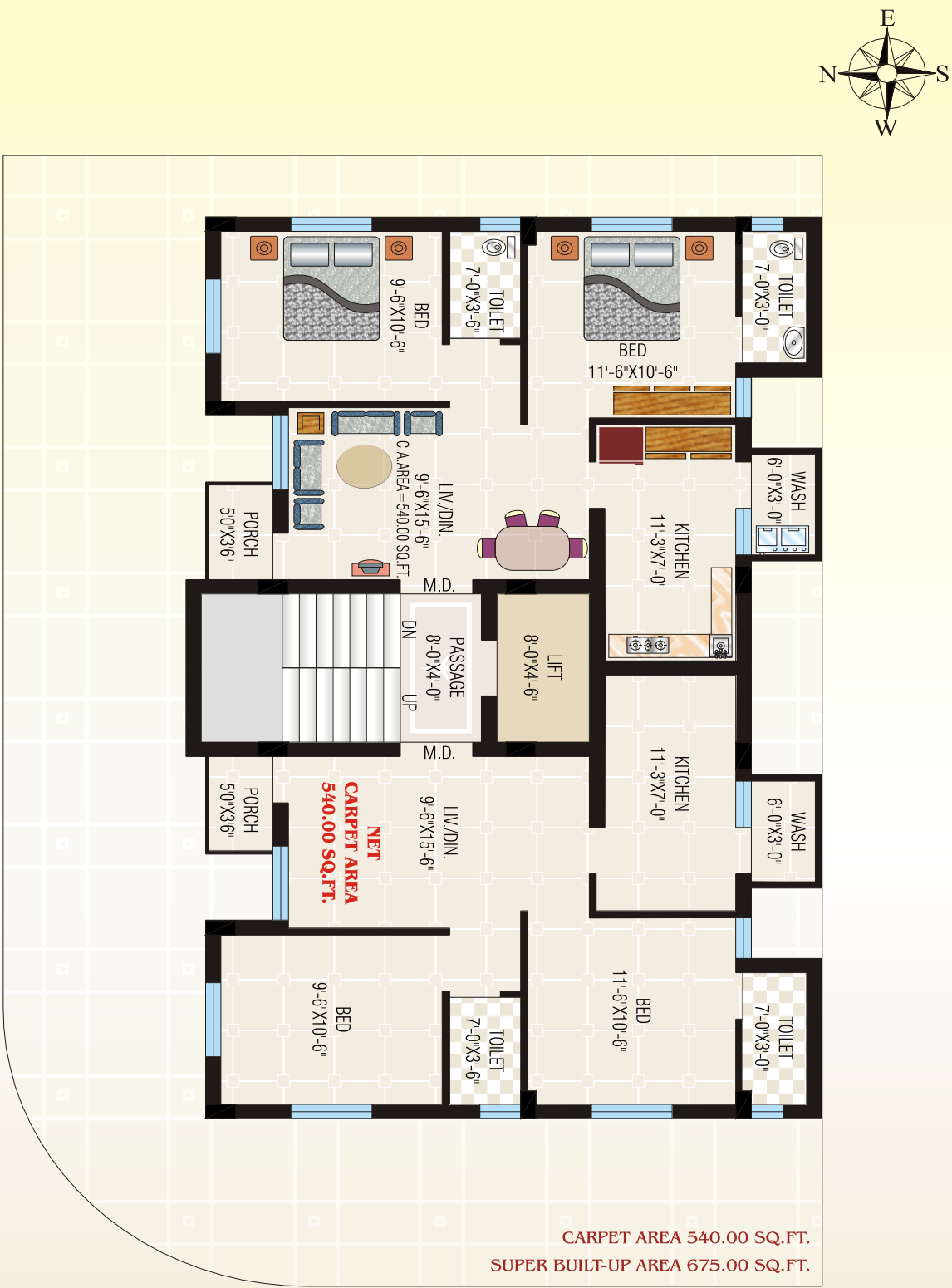
TYPICAL FLOOR PLAN 1st to 4th Floor