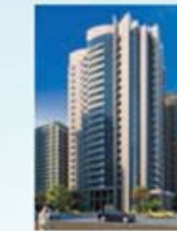
at Attavar, Mangaluru