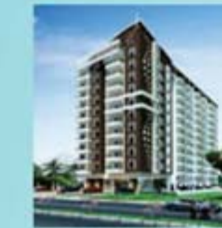
Primero - Padil, Mangaluru