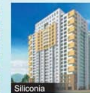
Siliconia at Kuttar, Mangaluru