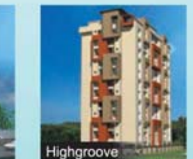
Highgroove at Bejai, Mangaluru