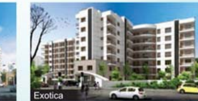
Exotica Near S.C.S Hospital, Bendore, Mangaluru