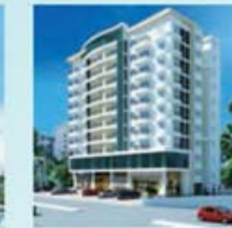
Micasa - Bejai, Mangaluru