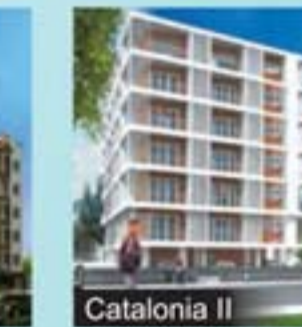
Catalonia II at Kulshekar, Mangaluru