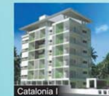
Catalonia I at Kulshekar, Mangaluru