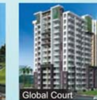
Global Court at Kuntikana, Near A.J Hospital Mangaluru