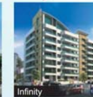
Infinity at Kankanady, Mangaluru