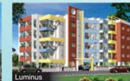
Luminus at Kulshekar, Mangaluru