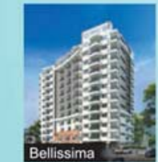
Bellissima at Mallikatta, Mangaluru