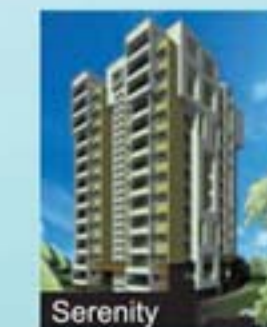
Serenity at Bejai, Mangaluru