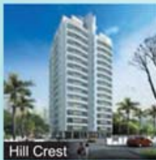
Hill Crest at Ladyhill, Mangaluru