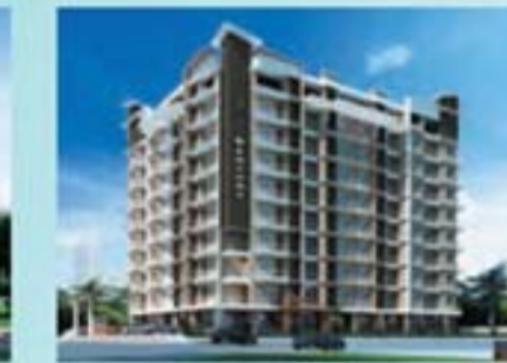
Ventura - Bejai Main Rd, Mangaluru