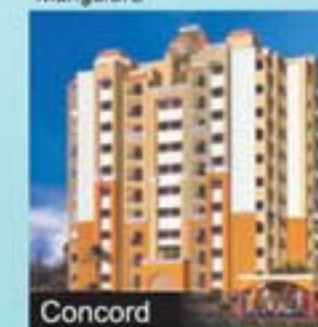
Concord at Fainir, Mangaluru