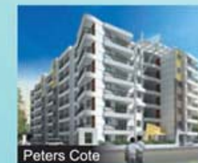
Peters Cote at Balkashrama Road, Mangaluru