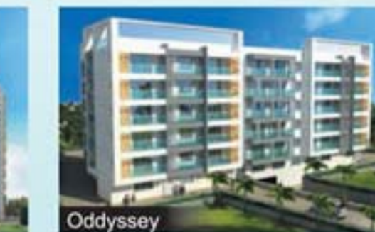
Odyssey at Arya Samaj Road, Mangaluru