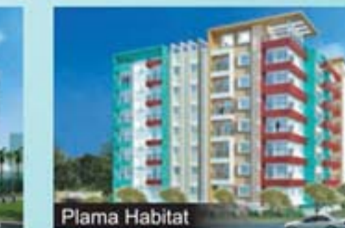
Plasma Habitat at Kulshekar, Mangaluru