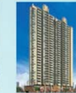
at Kadri Kambala, Mangaluru