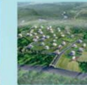
Golden Hills Layout at Pakshikere, Mangaluru