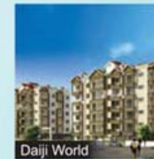
Daiji World at Bondel, Mangaluru