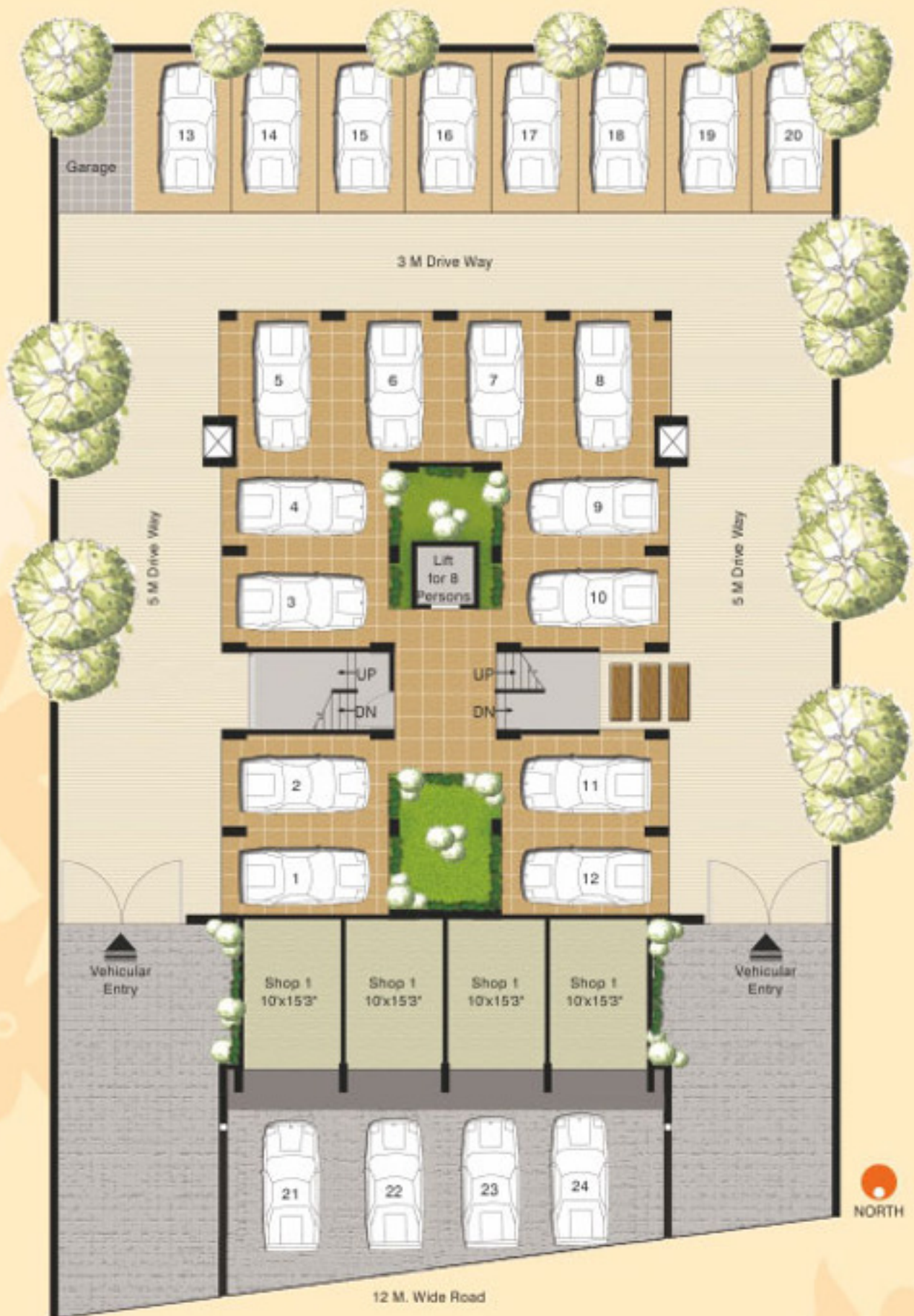
Parking Floor Shop Area : 213 sq.ft.