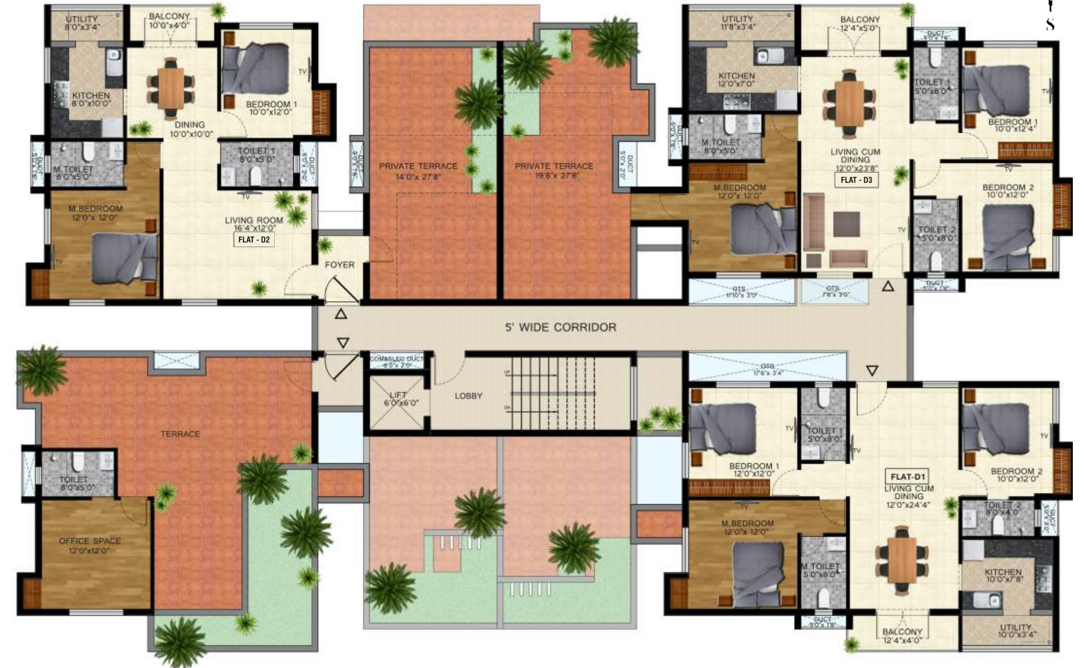
Forth Floor Plan

D1 - 1490 Sq. ft | D2 - 1497 Sq. ft | D3 - 1726 Sq. ft