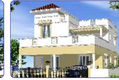
VILLAS Ph-IV - 2006