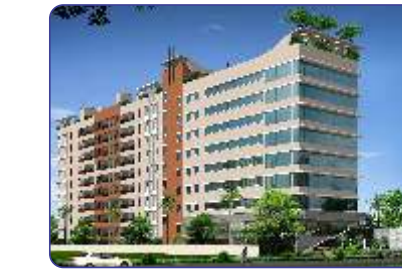
VICEROY - 2012