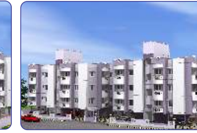
PAVANI - 2008