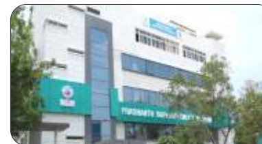
Prashanth super speciality hospital