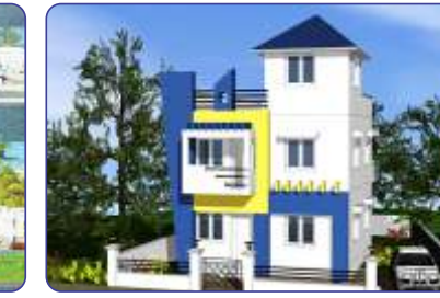
VILLAS Ph-II - 2003