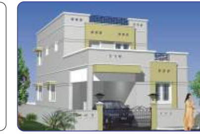
VILLAS Ph-I - 2001