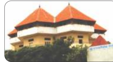
Navadisha Montessori School

Prestigious NAVADISHA MONTESSORI SCHOOL next door and close to DAV & SUN SHINE SCHOOL