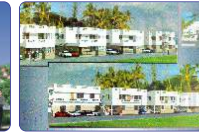
PARADISE - 2003