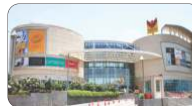
Phoenix Mall Velachery