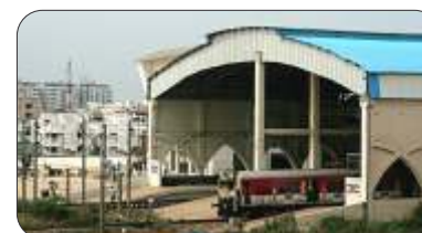
Velachery Railway Station