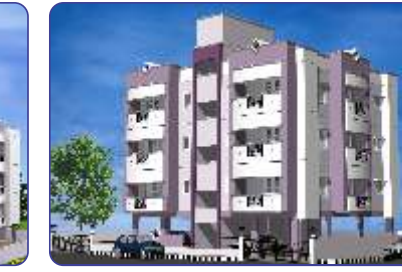
PAVITHRA - 2008