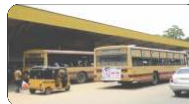
Velachery Bus Stand