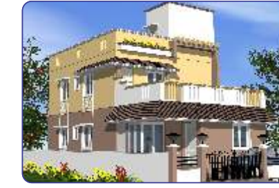
VILLAS Ph-III - 2005