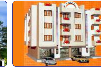
ARCADE - 2004