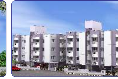
PADUKA - 2008