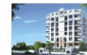
PEARL LEGACY at Rajendra Marg, Babu Nagar, Jaipur