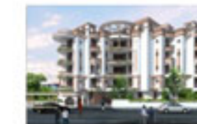
PEARL AMBIENCE at Krishna Marg, C-Scheme, Jaipur