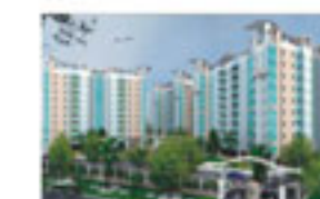
PEARL GARDENS at Ajmer Road, Jaipur