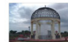
VILLAS AND PLOTS at Near Mahindra SEZ, Mahapura, Jaipur