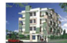
PEARL ISH NIWAS at Tilak Nagar, Jaipur