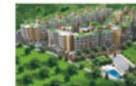
PEARL GREEN ACRES at Gopal Bypass, Jaipur