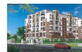
PEARL ELEGANCE at C-Scheme, Jaipur