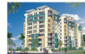
PEARL SPRINGS at Jagatpura, Jaipur