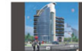
CLASS OF PEARL at Income Tax Colony, Jaipur