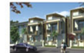
PEARL D' VILLA at Jagatpura, Jaipur