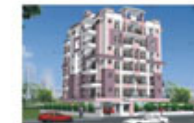
PEARL MEDHAM at Babu Nagar, Jaipur