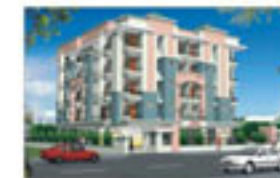
PEARL ARUN at Babu Nagar, Jaipur