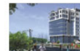
SURYAVANSHI PEARL at SP Marg, C-Scheme, Jaipur