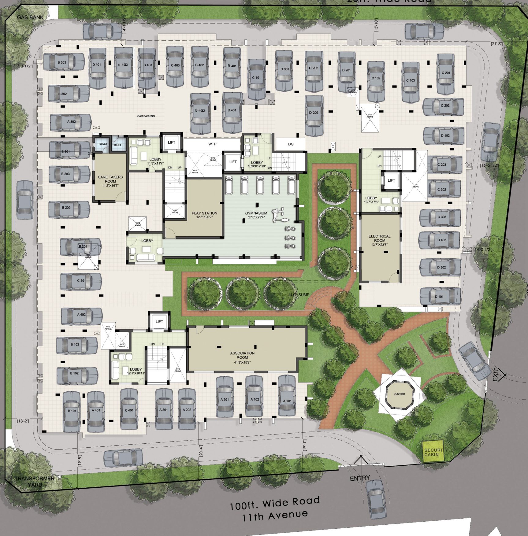
SITE CUM STILT FLOOR PLAN