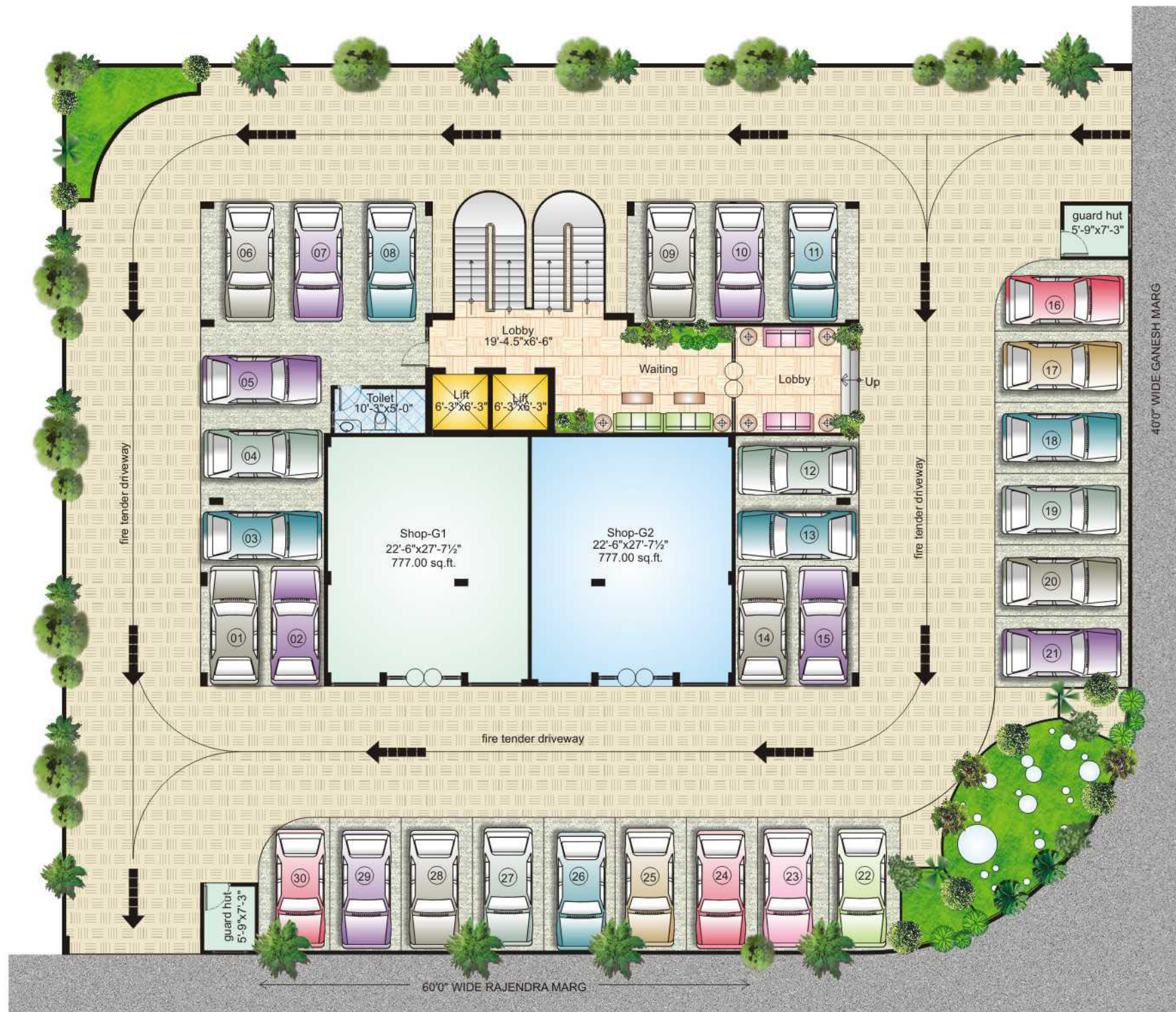
Stilt Floor Plan