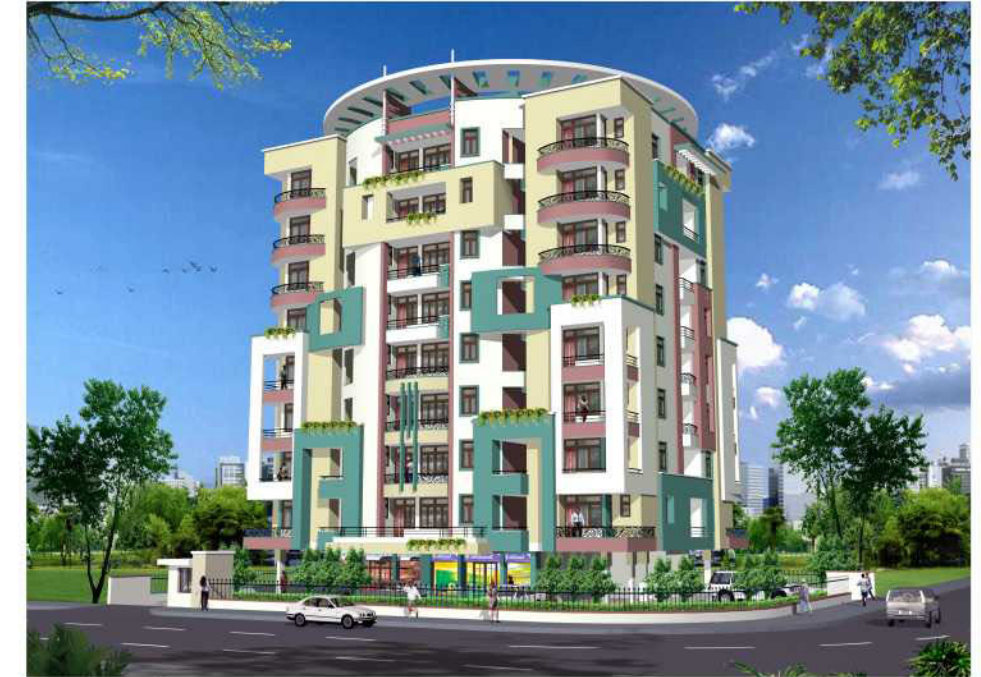
B-19, Rajendra Marg, Bapu Nagar, Jaipur