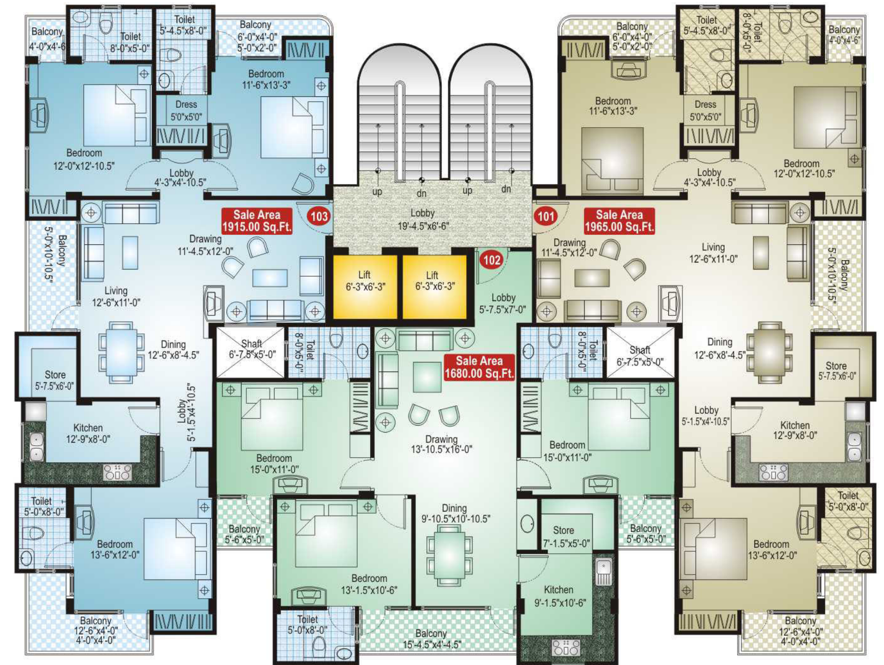
Typical Floor Plan 3 BHK