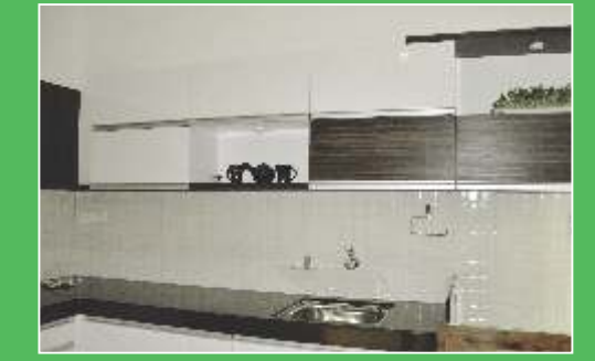
Well-planned kitchen space