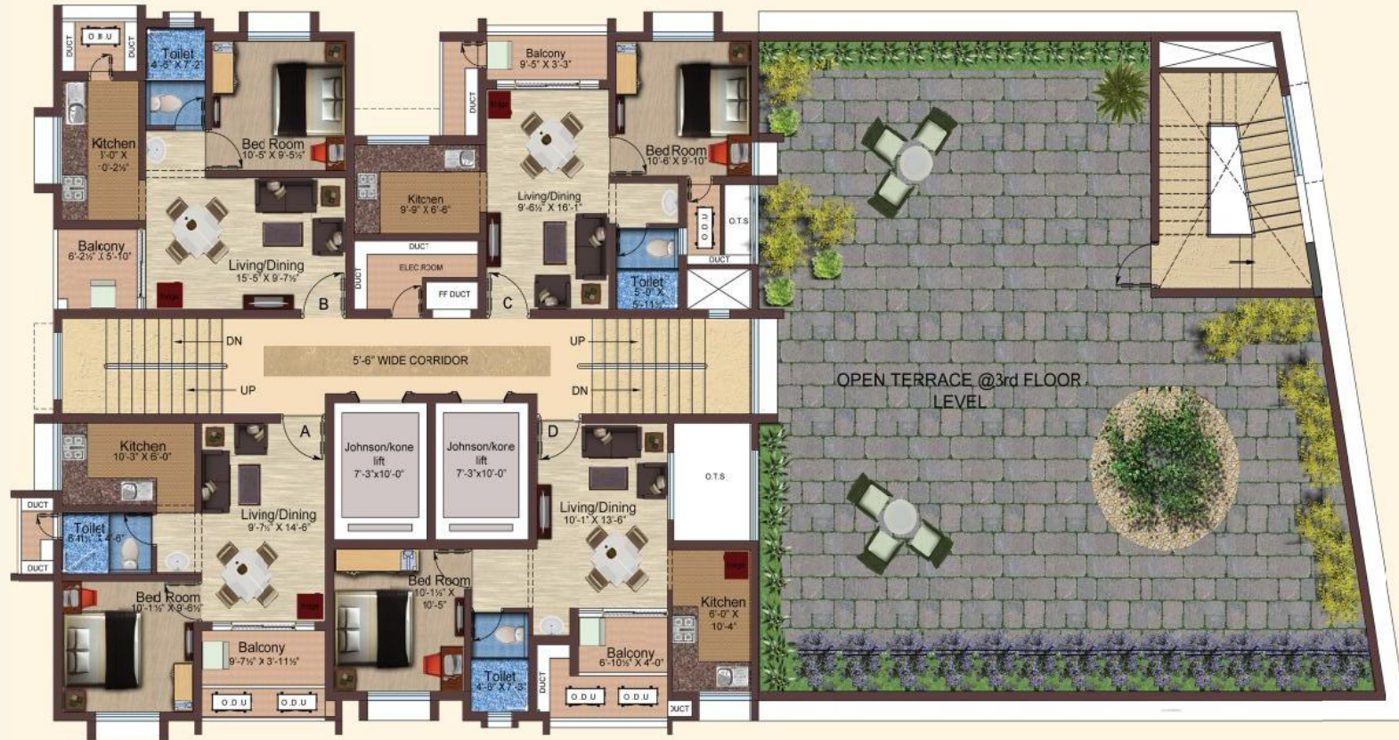
TYPICAL FLOOR PLAN (1st -21st FLOOR) BLOCK-4