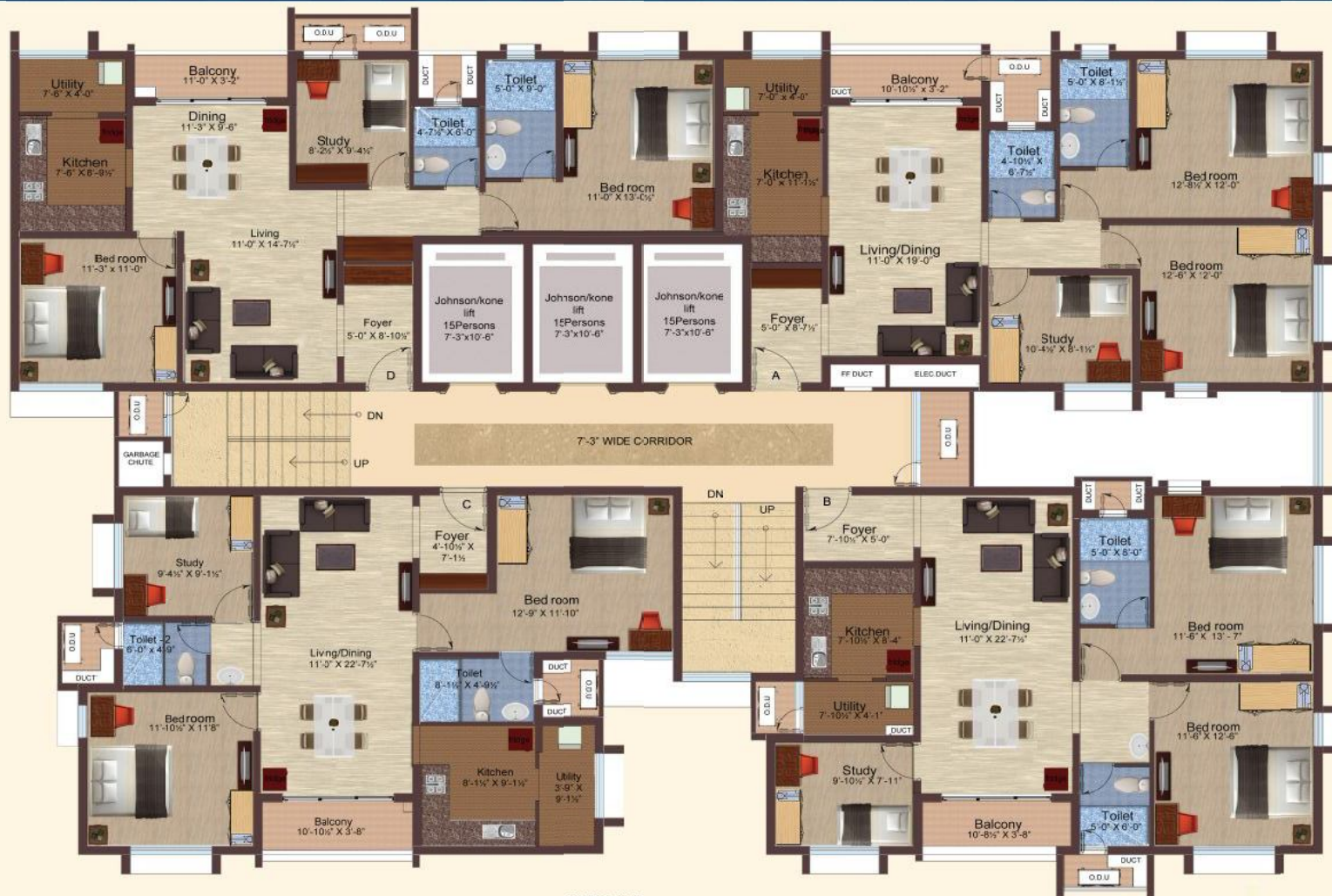
TYPICAL FLOOR PLAN (2ND - 26 TH FLOOR) BLCK-3