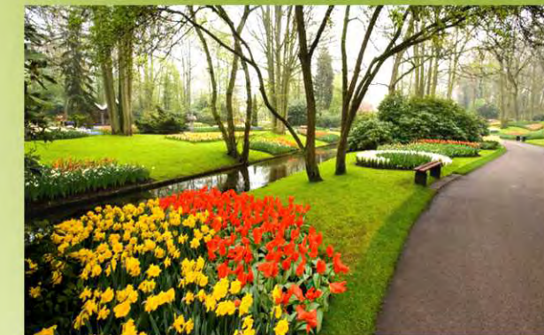
Landscaped open areas