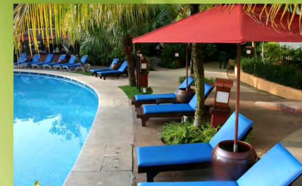
Open air swimming pool