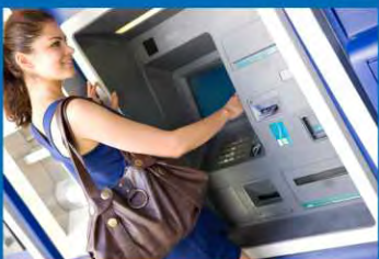
24 hrs. ATM