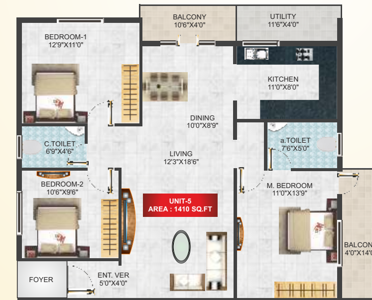
UNIT - 5 | 1410 Sq.ft | 3 BHK

Gangothri SLV Meadows •Luxurious Living in Elegant Surroundings