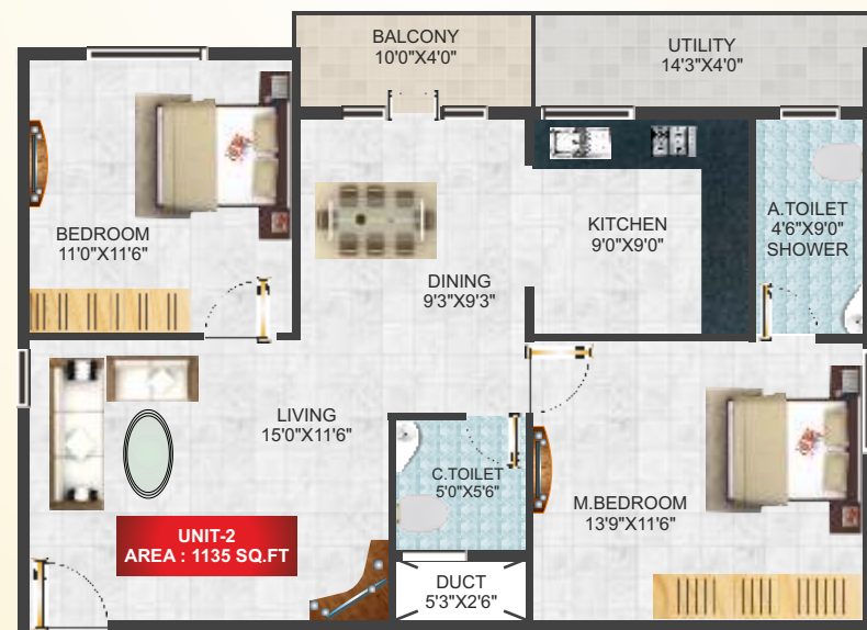
UNIT - 2 | 1135 Sq.ft | 2 BHK