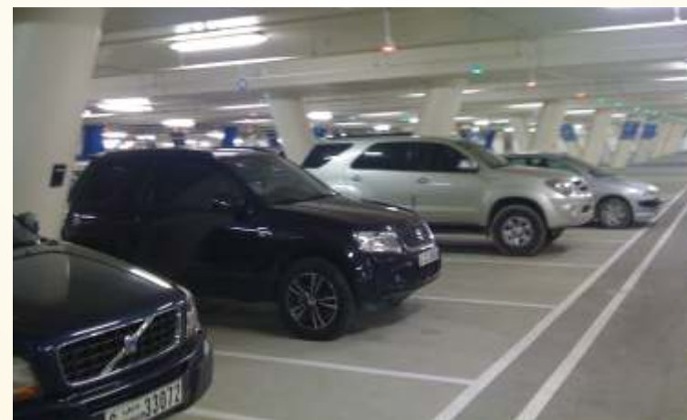
Covered Car Parking