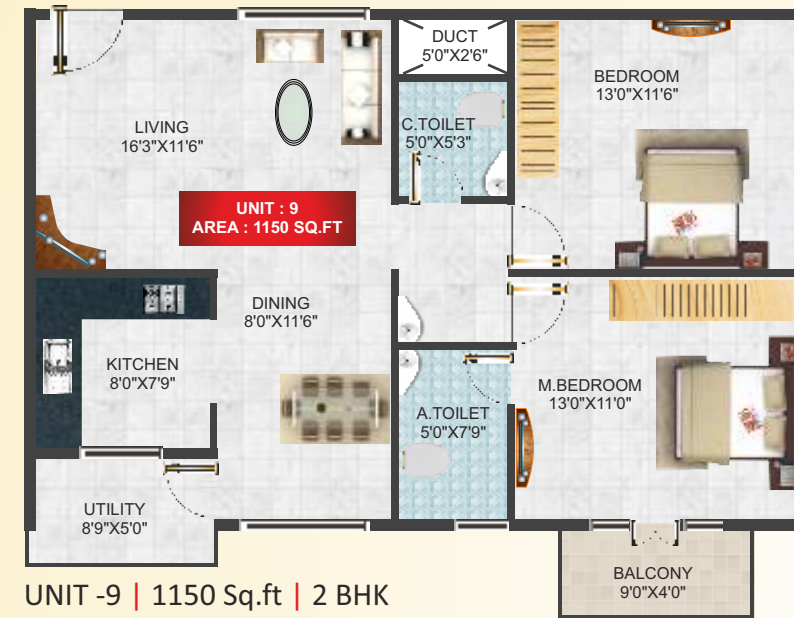
UNIT -9 | 1150 Sq.ft | 2 BHK