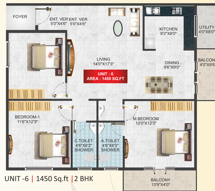
UNIT - 6 | 1450 Sq.ft | 2 BHK