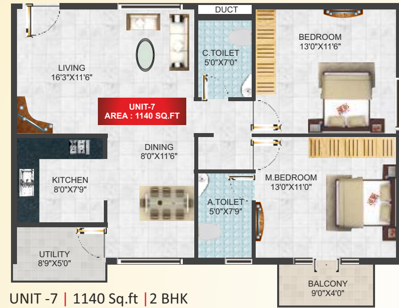
UNIT -7 | 1140 Sq.ft | 2 BHK