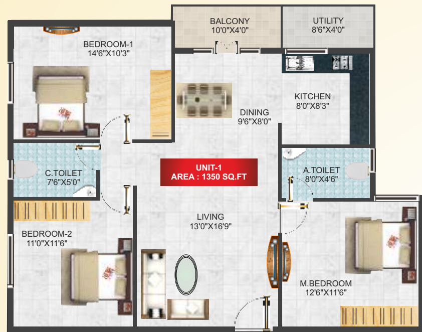
UNIT - 1 | 1350 Sq.ft | 3 BHK