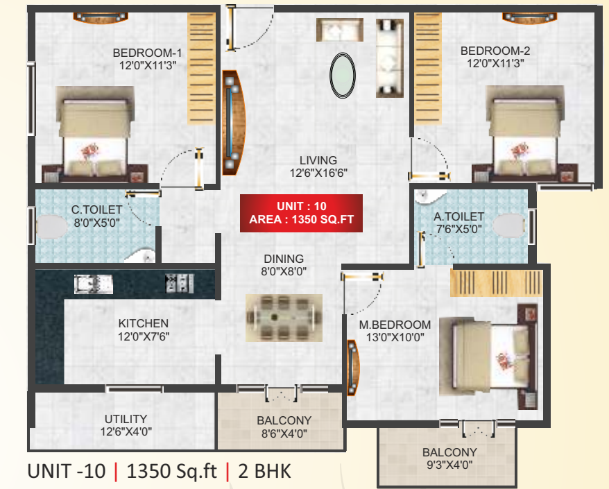
UNIT -10 | 1350 Sq.ft | 2 BHK