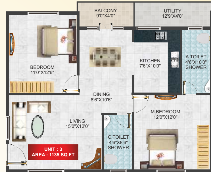
UNIT - 3 | 1135 Sq.ft | 2 BHK