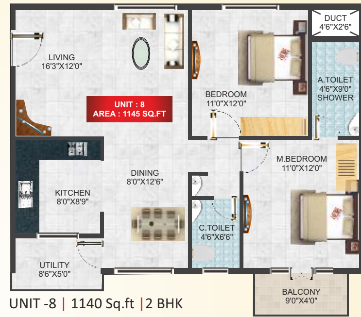
UNIT -8 | 1145 Sq.ft | 2 BHK