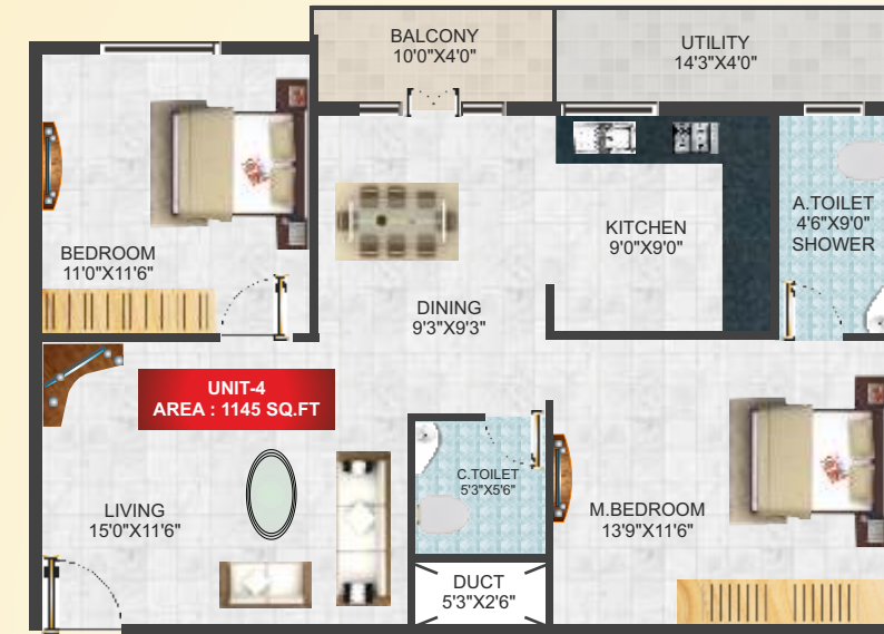
UNIT - 4 | 1145 Sq.ft | 2 BHK