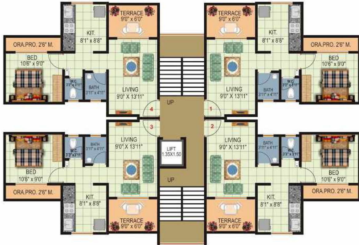
FIRST, THIRD, FIFTH & SEVENTH FLOOR PLAN