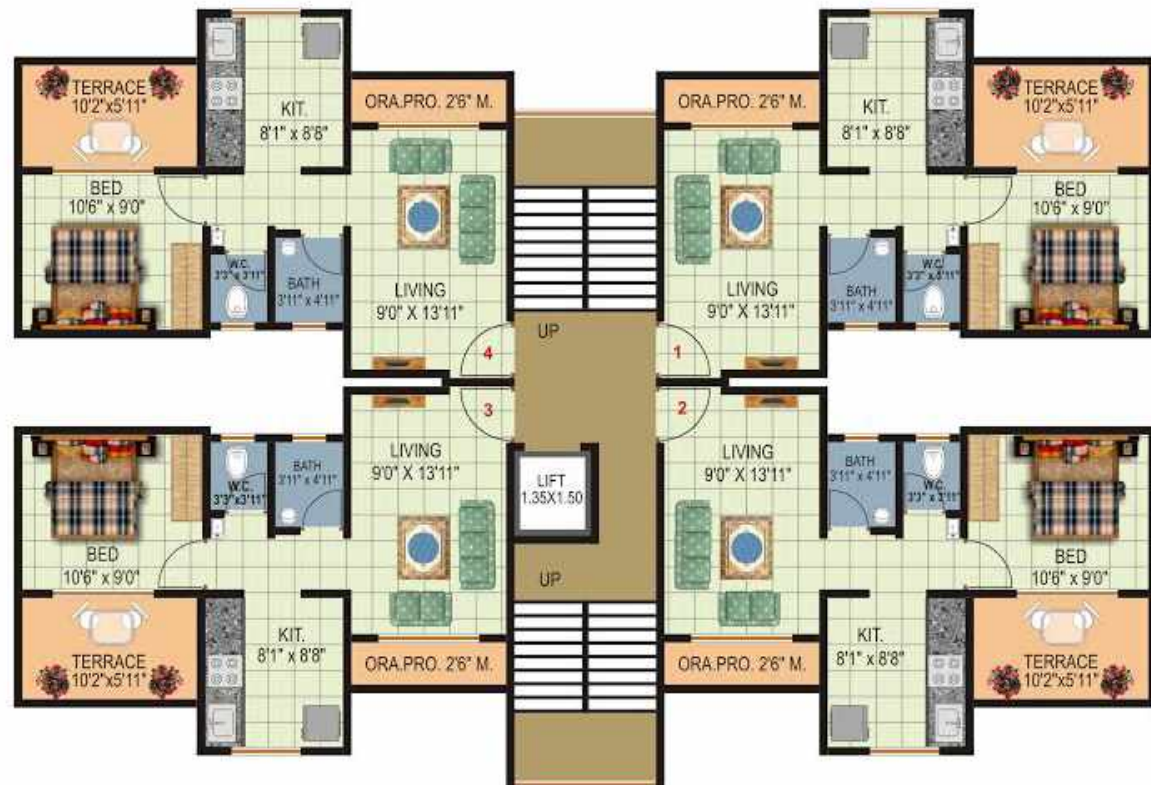
SECOND, FOURTH & SIXTH FLOOR PLAN