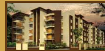
LEGACY ESTILO 2,190 - 2,850 sq.ft luxury homes Yelahanka