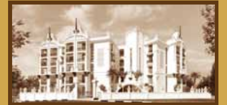
LEGACY CELINO 2,250 - 3,750 sq.ft ultra luxury homes Hebbal, off International Airport Road