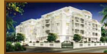
LEGACY CASERO 3,300 - 6,000 sq.ft ultra luxury homes Jakkur Plantation