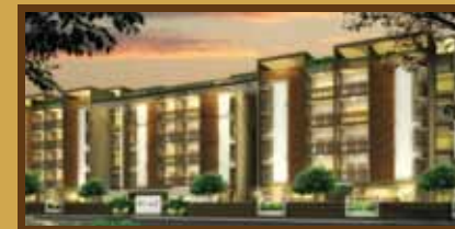
LEGACY ARISTON 1,180 - 2,360 sq.ft luxury homes Yelahanka