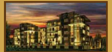
LEGACY SORENO 2,120 - 2,250 sq.ft luxury homes Tata Nagar, Off Hebbal ORR