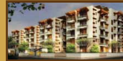
LEGACY DIMORA 2,750 sq.ft ultra luxury homes Jakkur Plantation