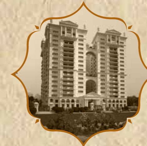
LEGACY CIRROCO 4,800-5,300 sq.ft Premium homes At Jakkur, on KIAL Road