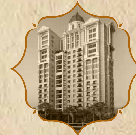
LEGACY MAXIMUS 4,600-4,900 sq.ft Limited edition homes Brigade Road