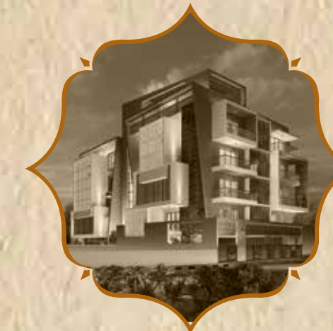
LEGACY MYCON DUV 3,000 sq.ft. Limited edition homes Cunningham road