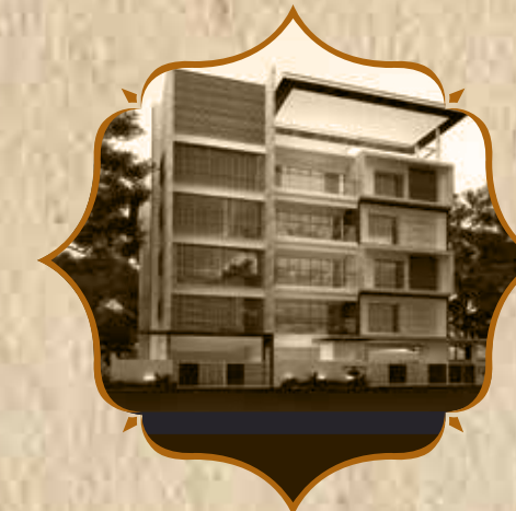
LEGACY MADELIA 3,875 - 4,170 sq.ft Limited edition homes Cunningham Road