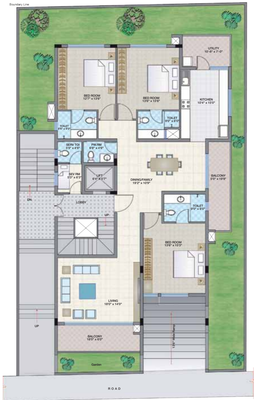
SBA - 2240 sq.ft | Private Garden Area - 870 sq.ft