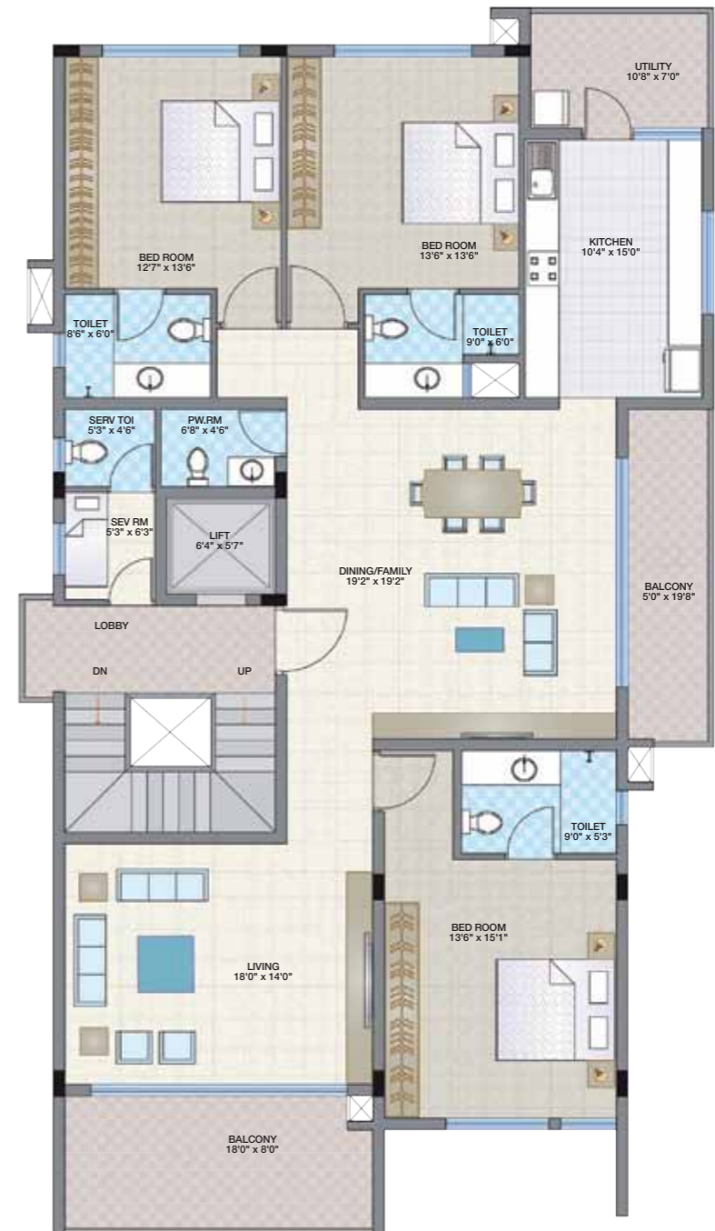
SBA - 2540 sq.ft