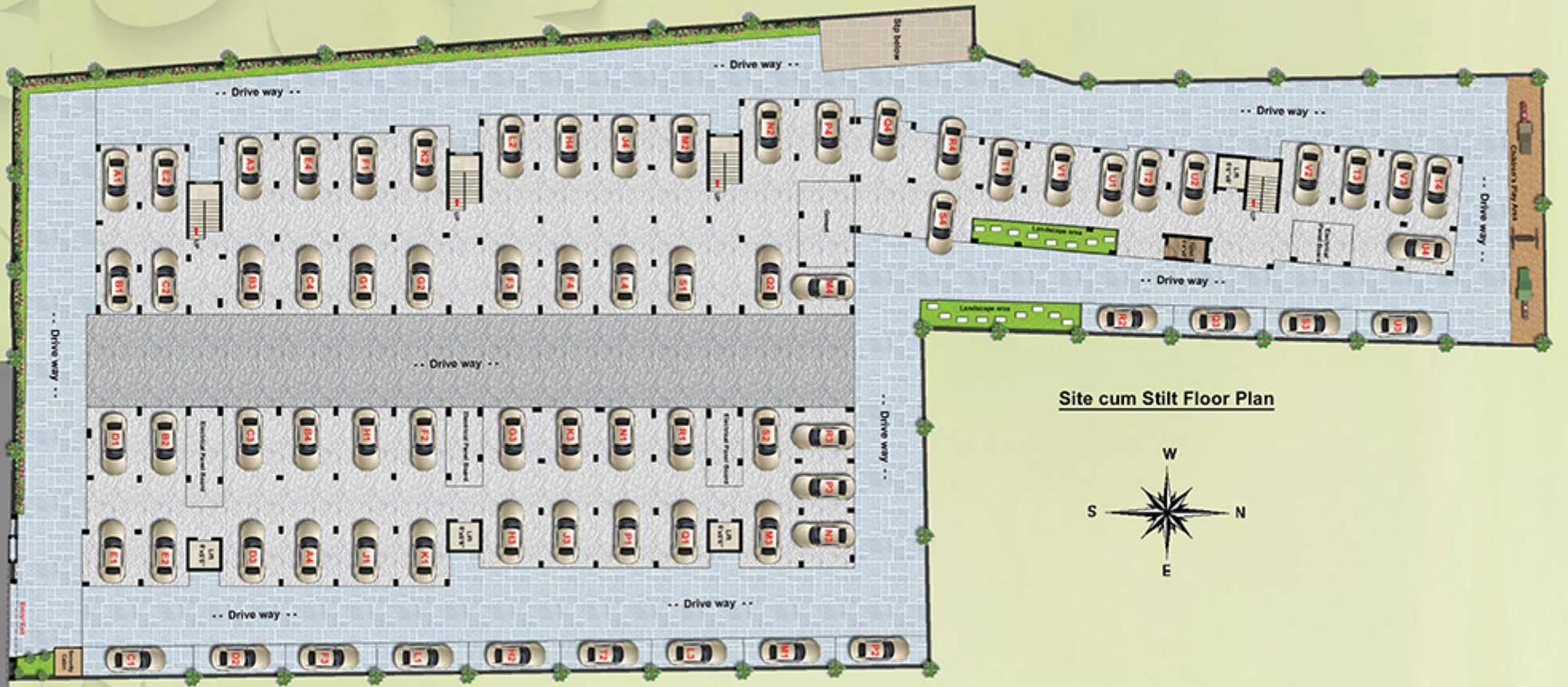
Site cum Stilt Floor Plan