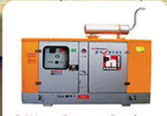
24Hrs Power Backup