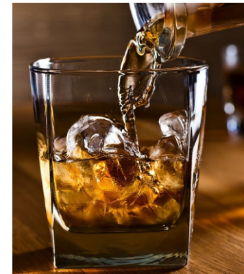
RESTAURANT & BAR