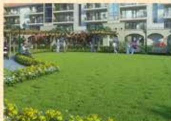
Landscaped large open green spaces