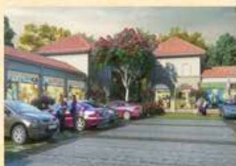
Shopping Complex inside the premises