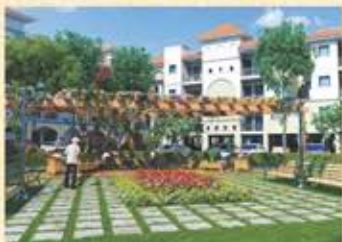
Special Zone for Elder Persons