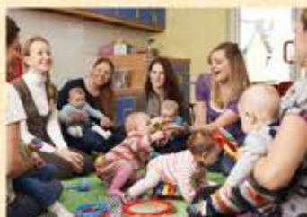
Modern Creche inside the premises