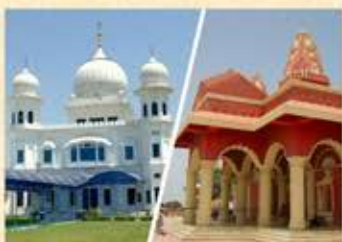
Temple & Gurdwara inside the premises