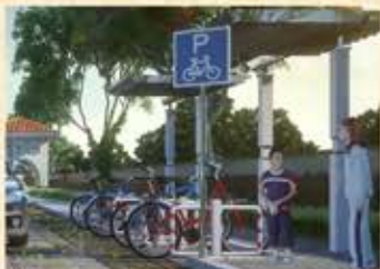
Eco Friendly Free Cycle docking & riding facility