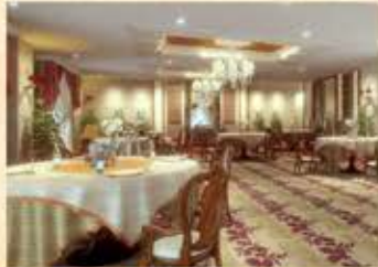
3 Star Banquet for indoor & outdoor functions