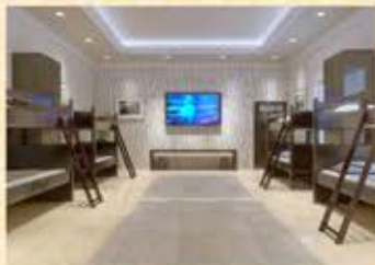
Dormitory for guest drivers inside the premises