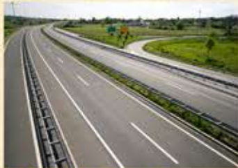
3 Highway Connectivity

Some of the finest facilities have been provided in the project to make it a dream project. A few of the highlights have been given here to give you the glimpse of the world class lifestyle that awaits you at COD.