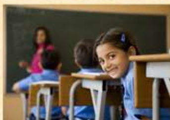
Nursery Primary Schools within premises