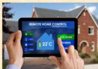
Smart Card security system