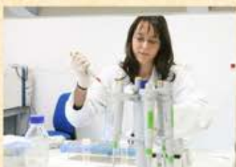
Diagnostic Centre inside the premises