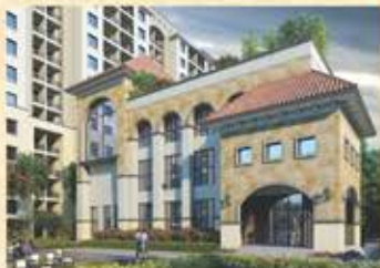
World Class club house