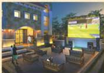
Open Air Theater for cultural extravaganza