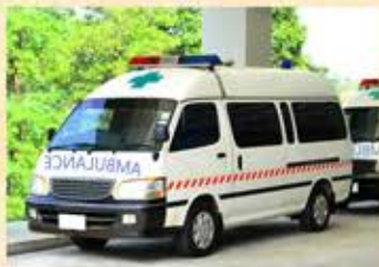
24x7 ambulance service