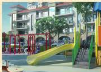
Safe kids play zone with rubberized landing floor