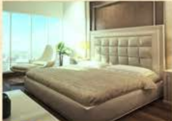
3 Star category rooms for guest stay