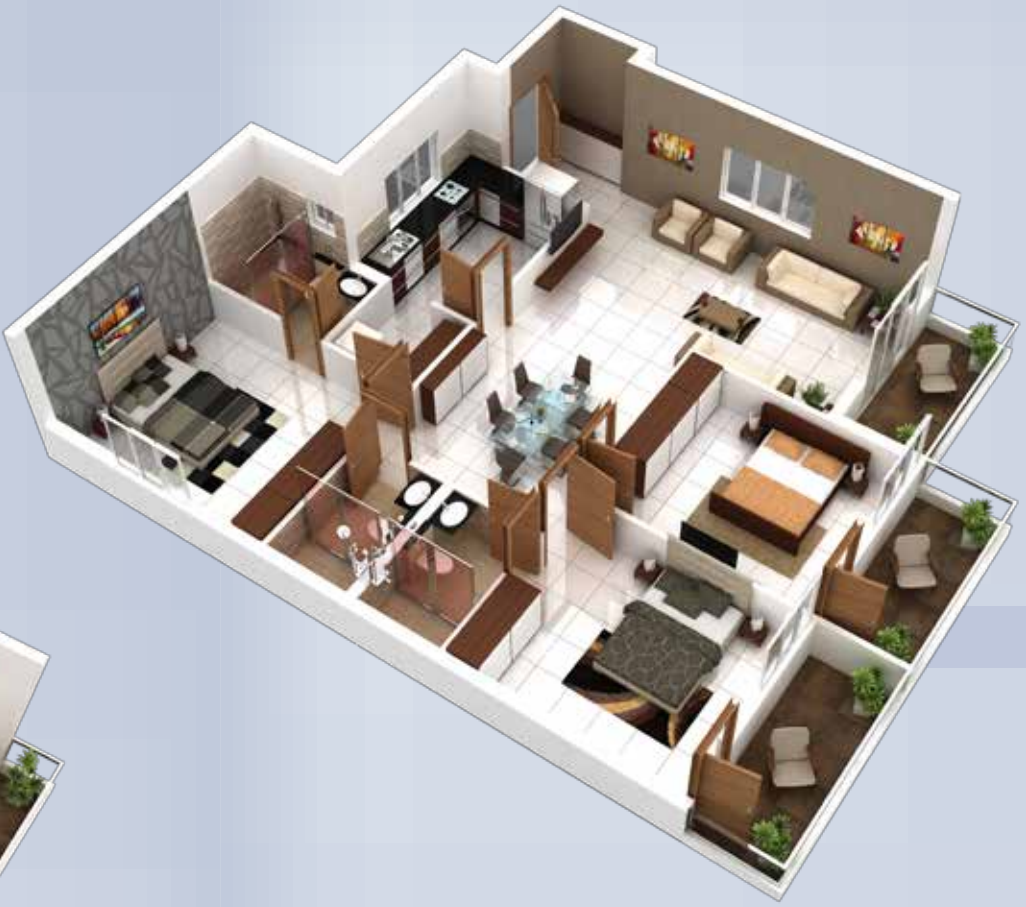
Unit 3: 3 BHK - 1710 sft