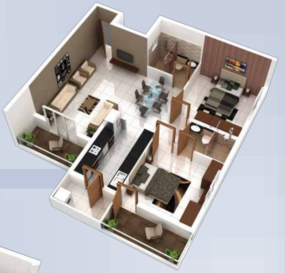
Unit 4: 2 BHK - 1305 sft