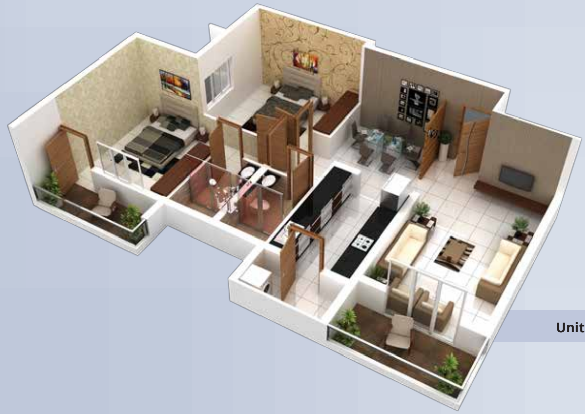
Unit 2: 2 BHK - 1355 sff