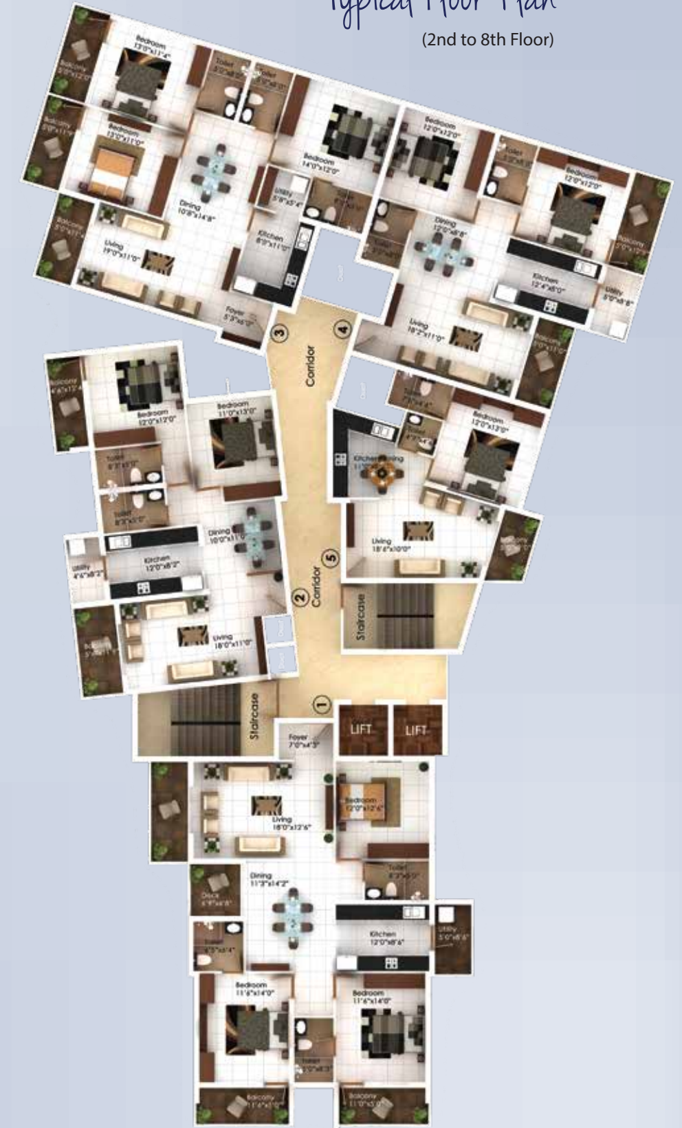
Typical Floor Plan (2nd to 8th Floor)

1: 3 BHK - 1750 sft | 2: 2 BHK - 1355 sft 3: 3 BHK - 1640 sft | 4: 2 BHK - 1175 sft 5: 1 BHK - 705 sft