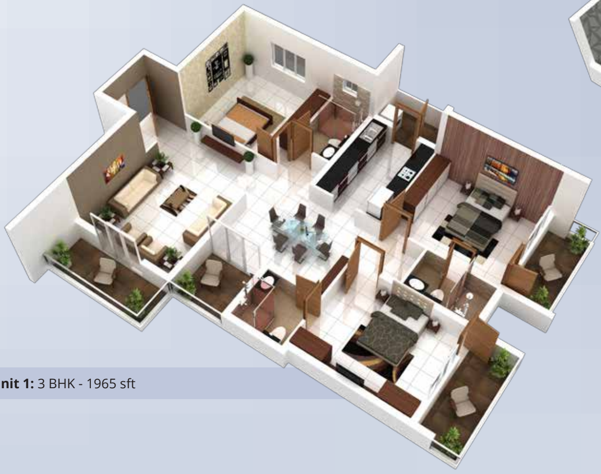
Unit 1: 3 BHK - 1965 sft