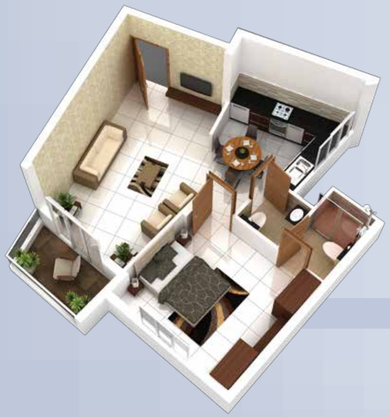
Unit 5: 1 BHK - 760 sft