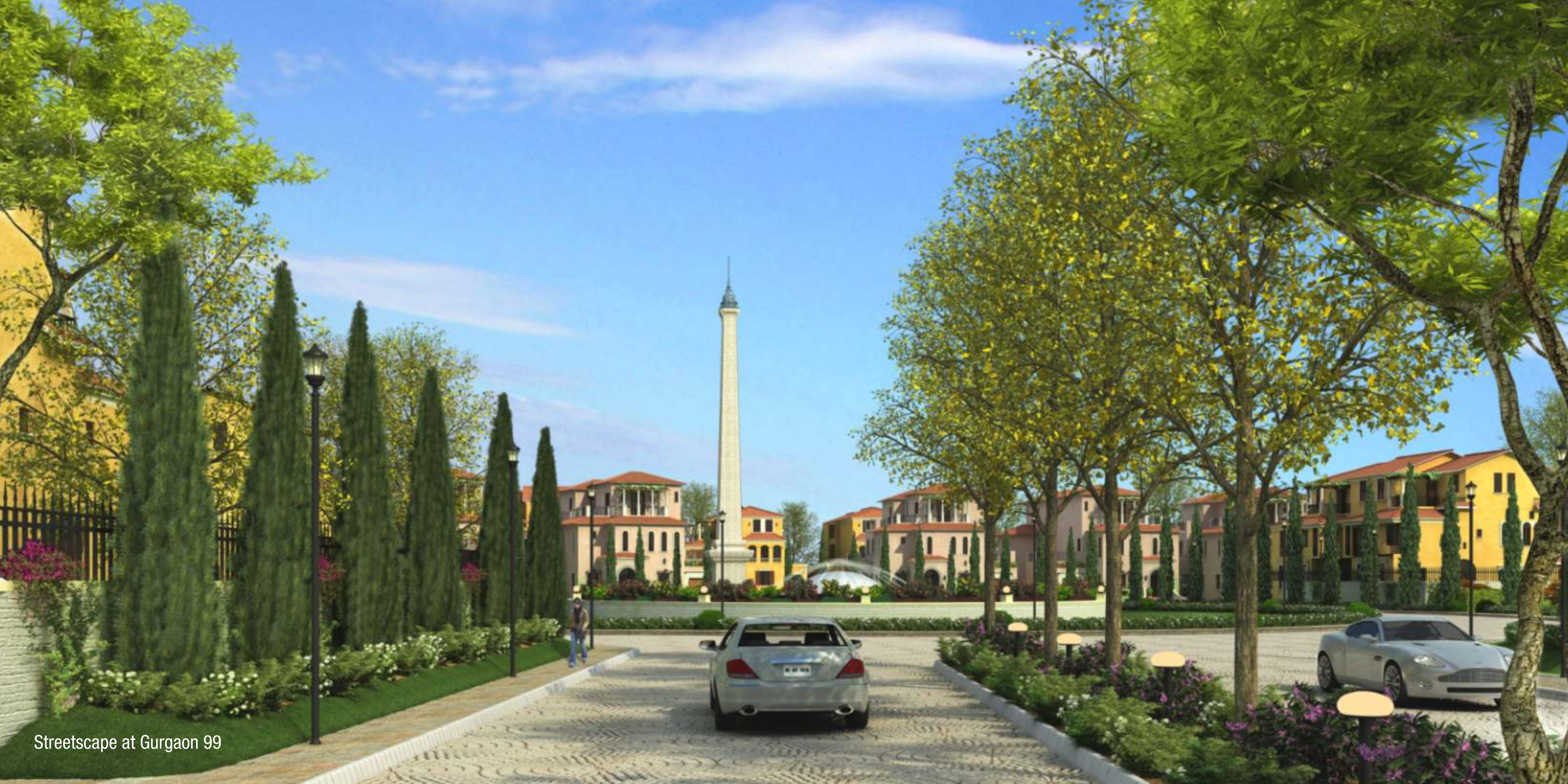
Streetscape at Gurgaon 99