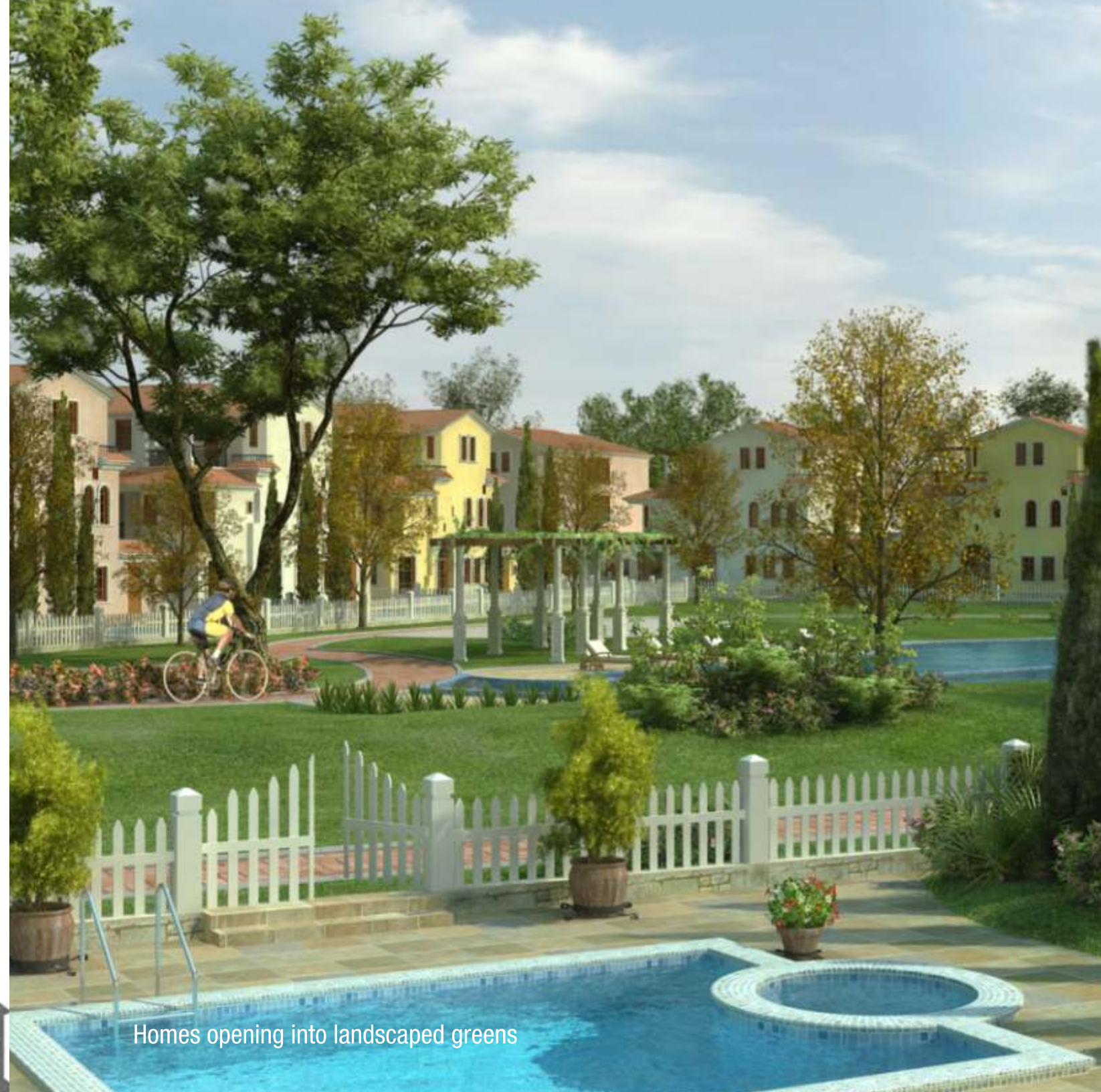
Homes opening into landscaped greens