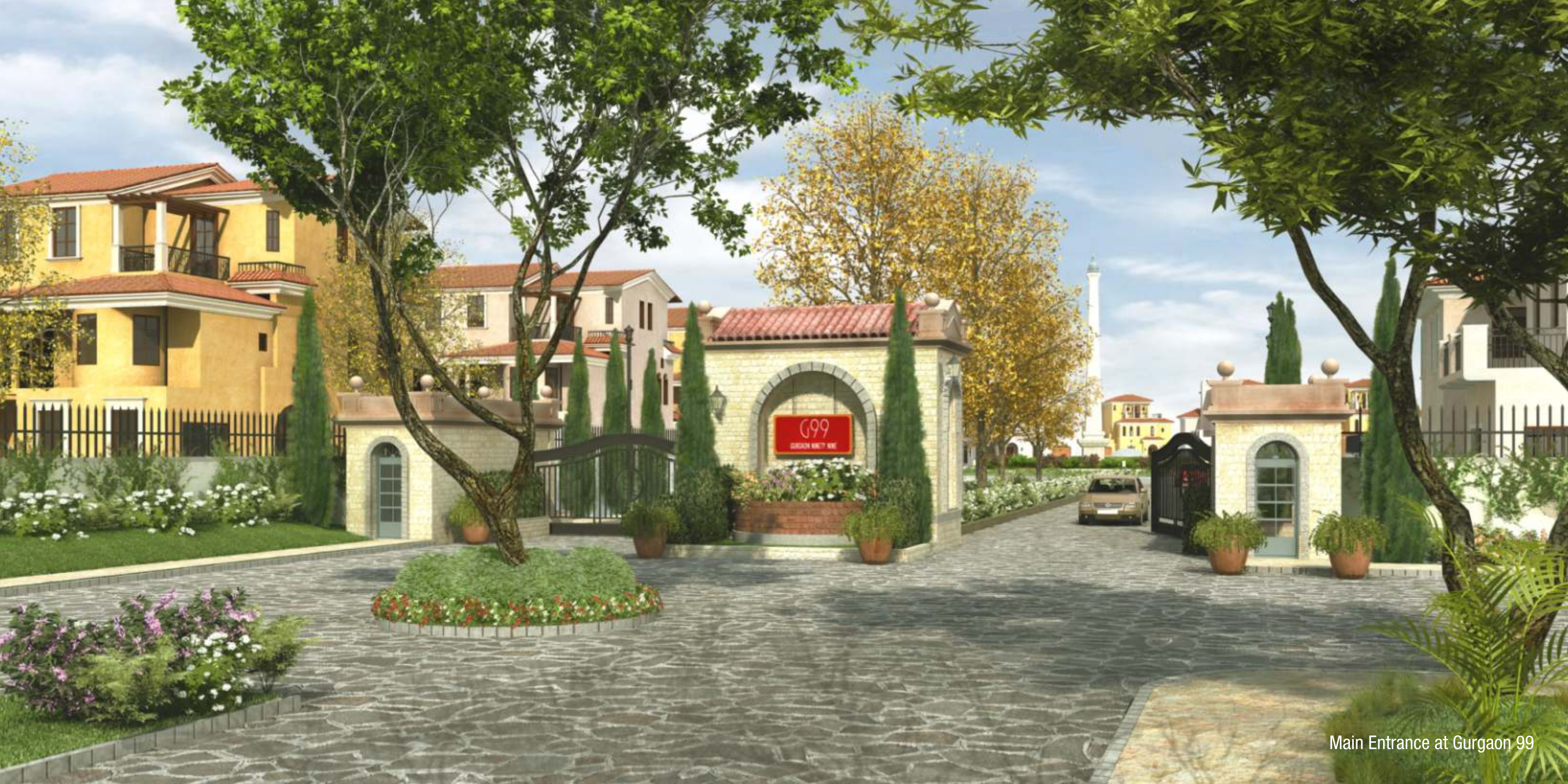
Main Entrance at Gurgaon 99