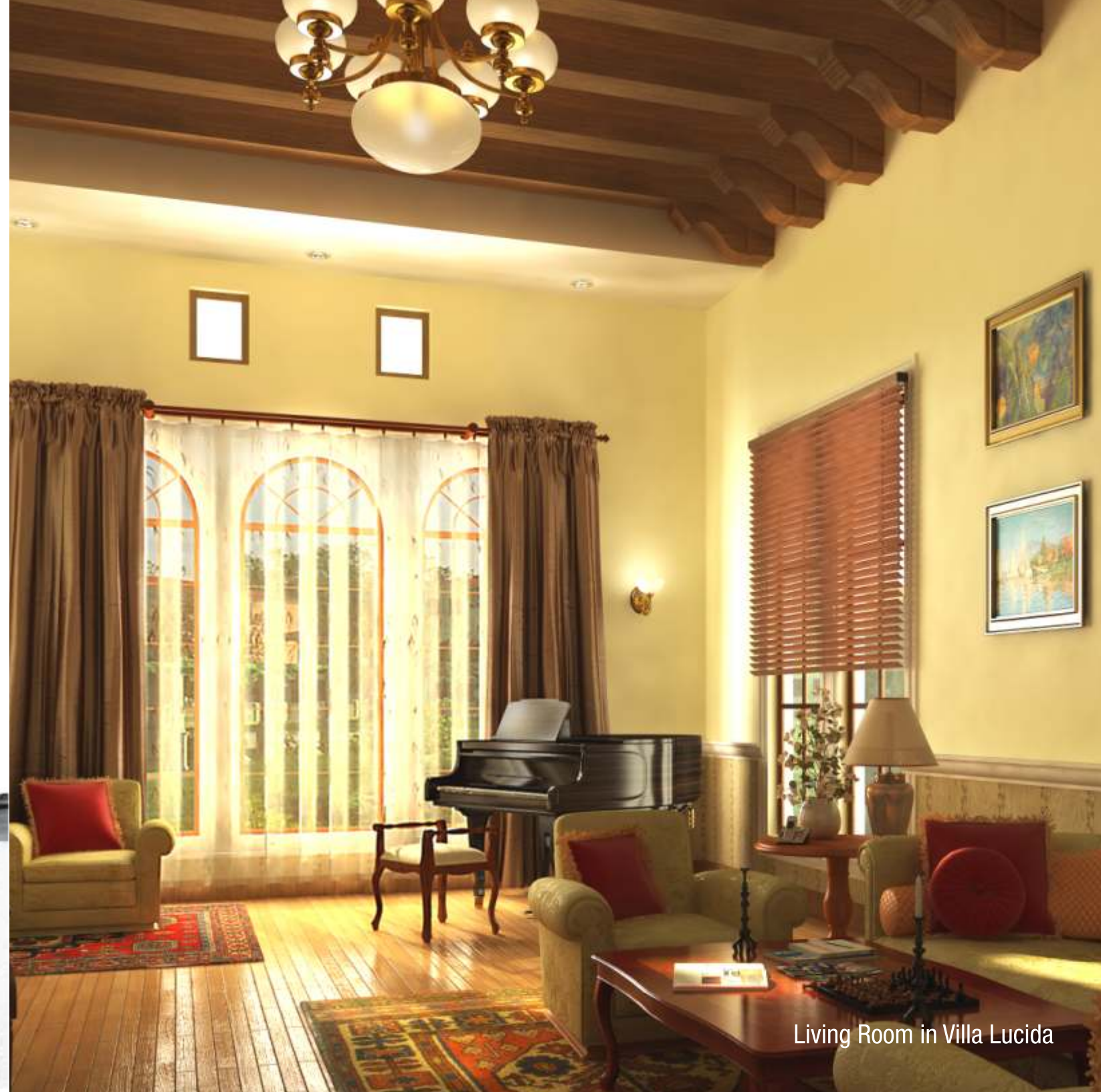
Living Room in Villa Lucida