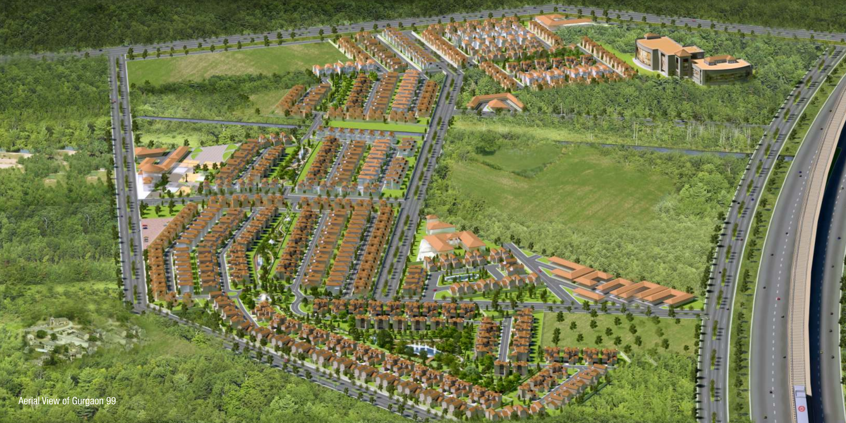
Aerial View of Gurgaon 99