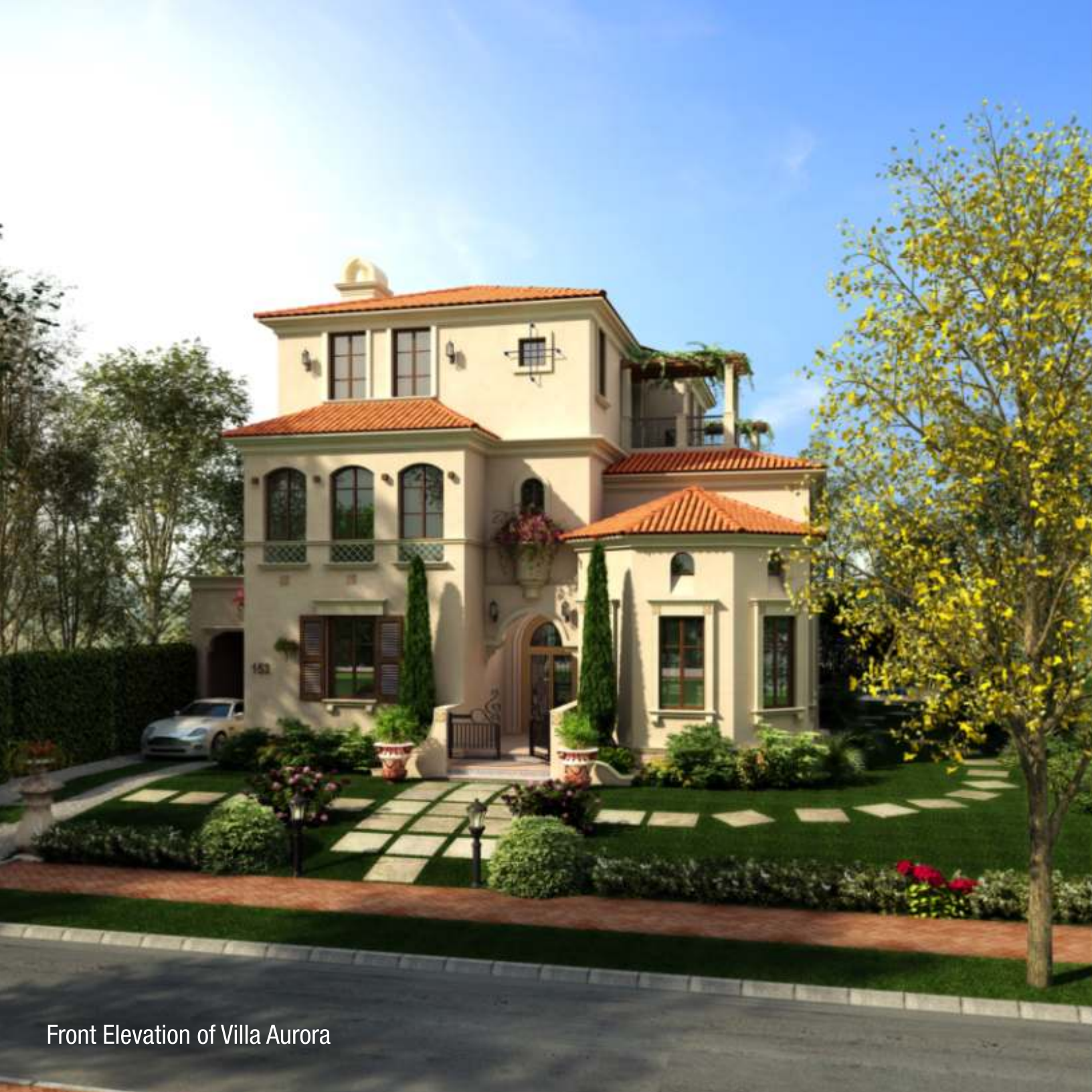
Front Elevation of Villa Aurora