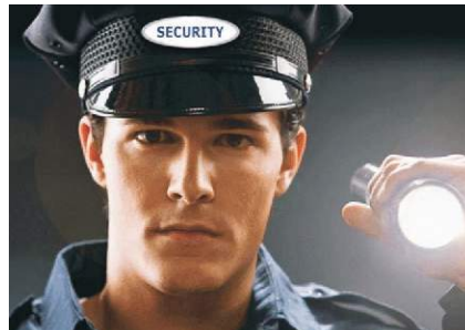
24 Hr Security