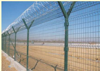
Outer Wall Compound & Fencing