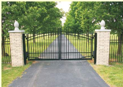
Main Entrance Gate

The location is in the heart of developments like schools, colleges, hotels & residential projects and it will be a very satisfying for owning a land in this area.