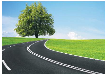
Internal Tar Road