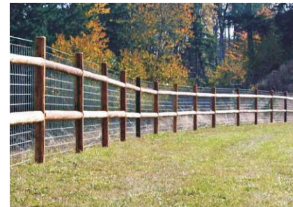
Individual Wire Fencing