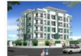
Golden Palm, B-69, Tilak Nagar