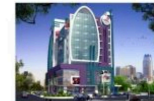
Commercial at Sahkar Marg