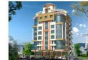
Monarch, Hanuman Nagar, Vaishali Nagar