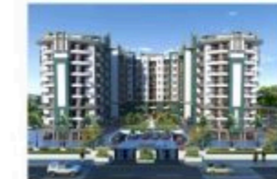
Residential at Kushal Nagar