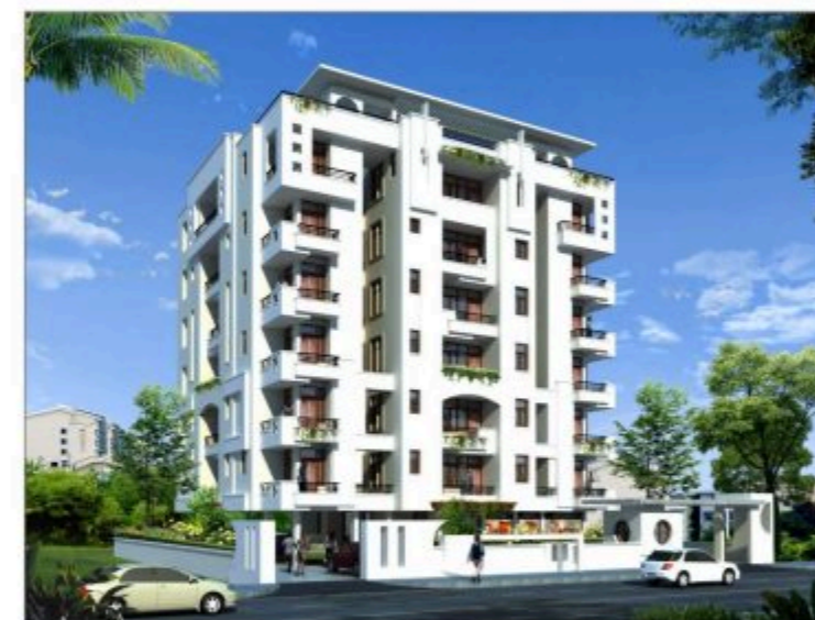
Site : Plot No. C-207-208, Gautam Marg, Hanuman Nagar, Jaipur