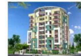
Basant Kunj, Rajendra Marg, Bapu Nagar