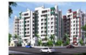
Greenpark, Janta Colony