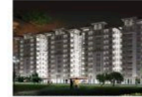
Metropolis, Jaisinghpura, Ajmer Road