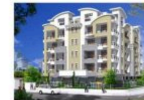
Retreat, Civil Lines