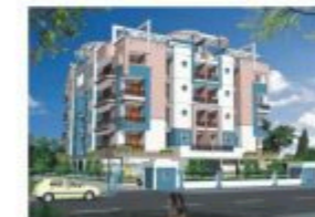
B-83, Golden Jewel, Bapu Nagar