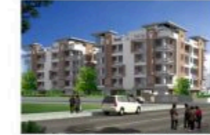
Rukmani Garden, Shiv Marg, Banipark