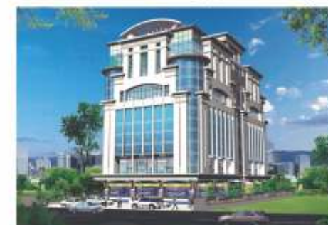
Hotel SDC Empire , Ganga Jamuna Petrol Pump