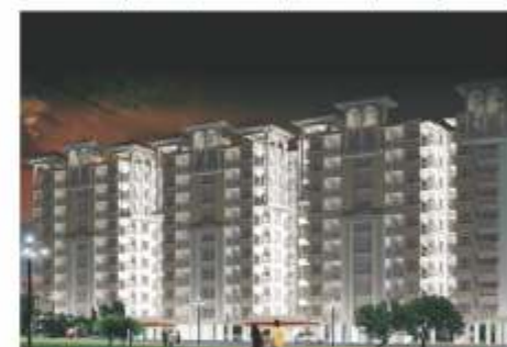
SDC Metropolis , Jaisinghpura, Ajmer Road