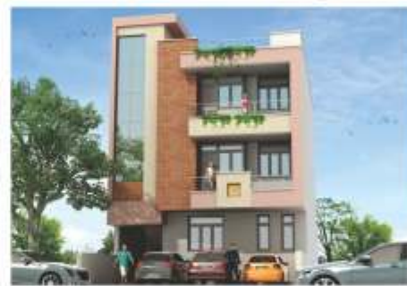
The Residency, Sewage Farm