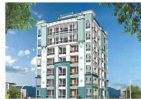
Golden Sobhagya, Bapu Nagar