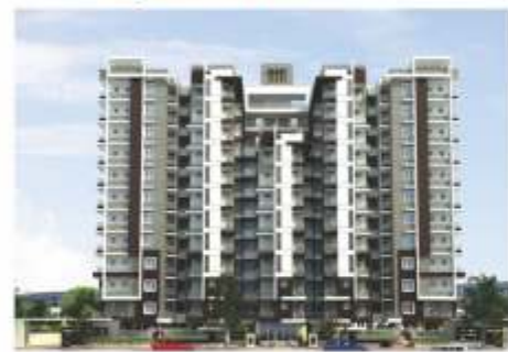
Keystone, Kumbha Marg