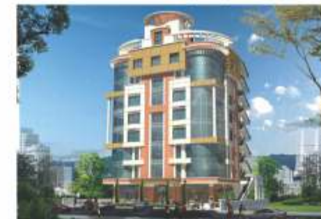
Monarch , Hanuman Nagar, Vaishali Nagar