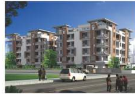
Rukmani Garden, Bani Park