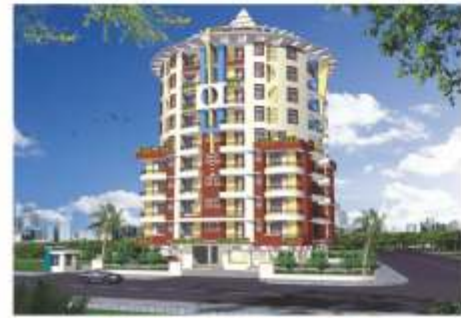
Karan Heights, Lal Kothi