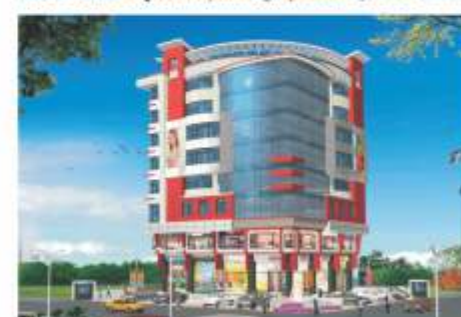
SDC Golden Atlantis , Vaishali Nagar