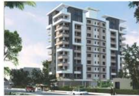
Oasis, Janta Colony