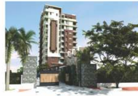
Anita Enclave, Jaistngh Highway