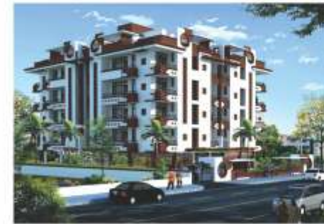
B-6 Moti Marg , Babu Nagar