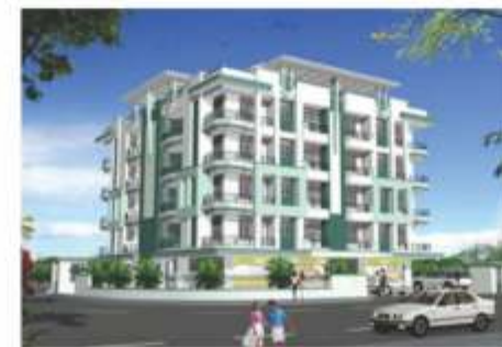
B-69, Golden Palm , Tilak Nagar