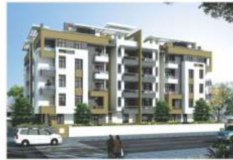
Kalpvriksha, Bani Park