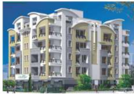
Retreat, Civil Lines