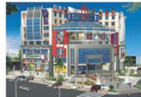
Evershine Tower , Vaishali Nagar