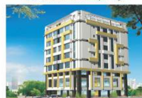
Hotel SDC Peppermint , Subhash Nagar