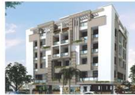
SDC Aura, Barkat Nagar