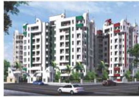
Green Park, Janta Colony