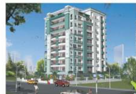
Golden Sunflower , Babu Nagar