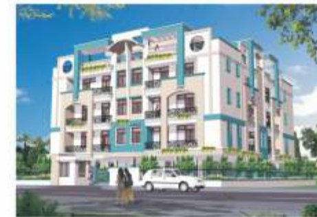
Golden Harmony , Babu Nagar