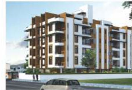
SDC Classic , Tagore Path, Banipark