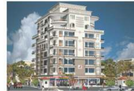
Golden Heights , Babu Nagar