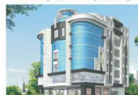
SDC Prime , Raja Park