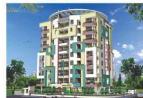
Basant Kunj , Rajendra Marg, Babu Nagar