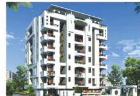
SDC DAV , Vaishali Nagar