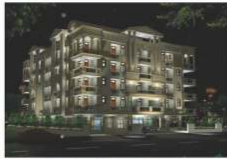
Victorian Empire, MD Road