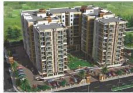
Euro Exotica, Kushal Nagar