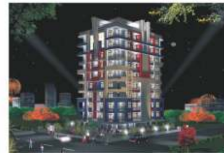
Golden Fortune , Babu Nagar