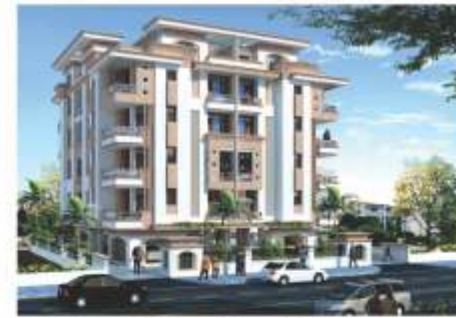
Royale, Bapu Nagar