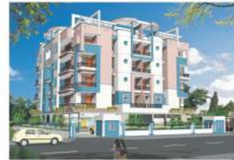
B-83, Golden Jewel , Babu Nagar