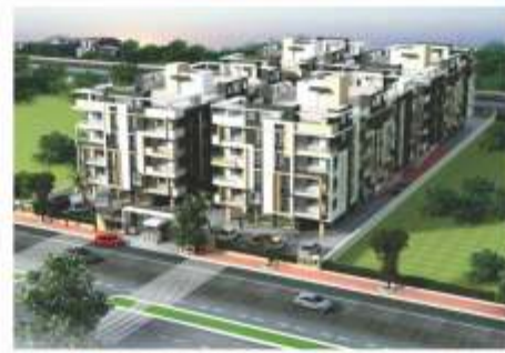
Gateway, Chitya Marg, Banipark