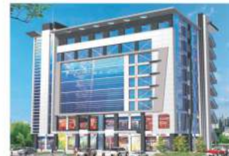
SDC Major Square , Mansarovar