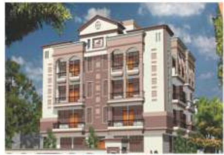
Raghuraj Enclave, C-Scheme