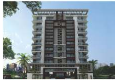
Ashok Millborn, Ahinsa Circle