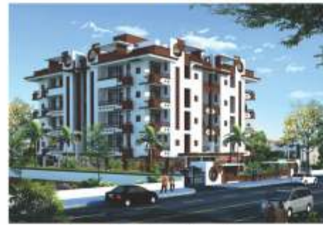
Ganesh Kripa, Bapu Nagar