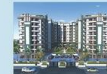
Residential at Kushal Nagar