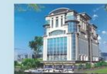
Pride, Near Ganga Jamuna Petrol Pump