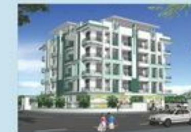
Golden Palm, B-69, Tilak Nagar