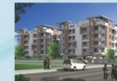
Rukmani Garden, Shiv Marg, Banipark