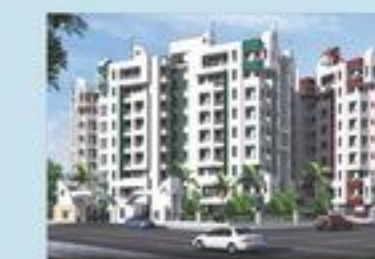
Greenpark, Janta Colony