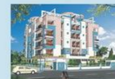
B-83, Golden Jewel, Bapu Nagar