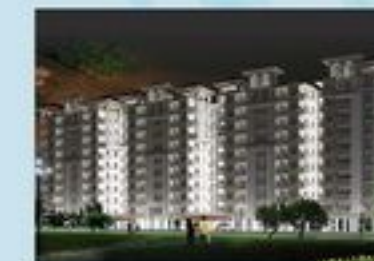
Metropolis, Jaisinghpura, Ajmer Road