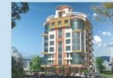
Monarch, Hanuman Nagar, Vaishali Nagar