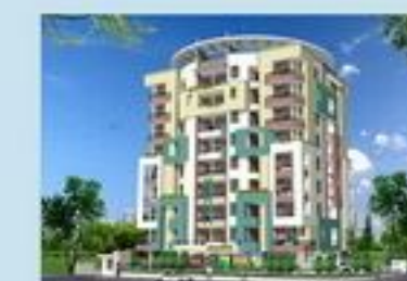
Basant Kunj, Rajendra Marg, Bapu Nagar