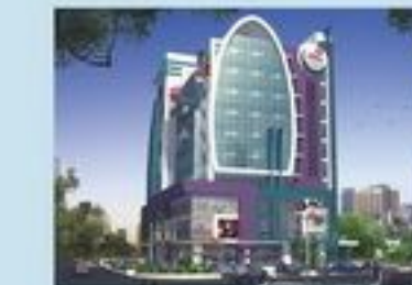
Commercial at Sahkar Marg