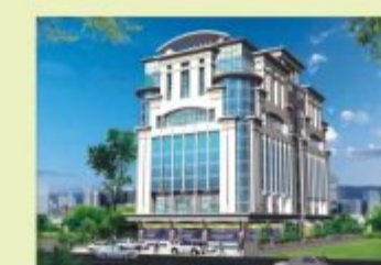
Pride, Near Ganga Jamuna Petrol Pump