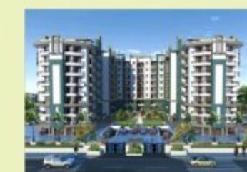
Residential at Kushal Nagar