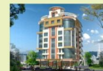
Monarch, Hanuman Nagar, Vaishali Nagar