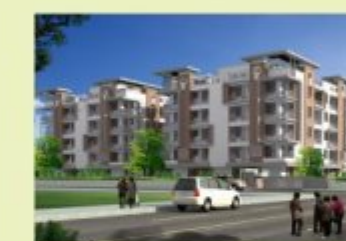
Rukmani Garden, Shiv Marg, Banipark