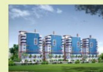
Vivay, Manji Colony, Malviya Nagar