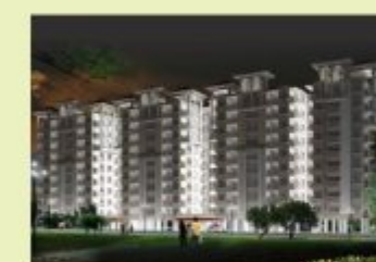
Metropolis, Jaisinghpura, Ajmer Road