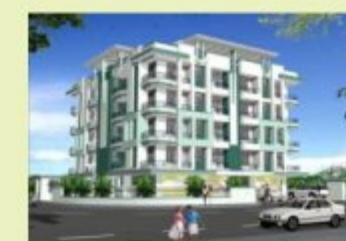
Golden Palm, B-69, Tilak Nagar