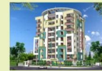
Basant Kunj, Rajendra Marg, Bapu Nagar