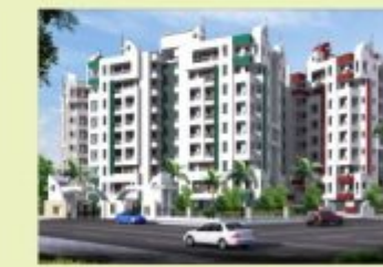
Greenpark, Janta Colony