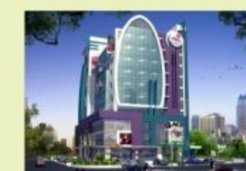
Commercial at Sahkar Marg