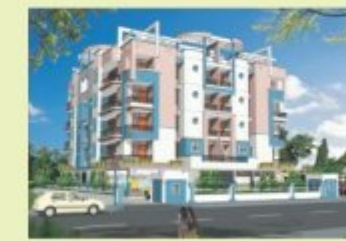
B-83, Golden Jewel, Bapu Nagar