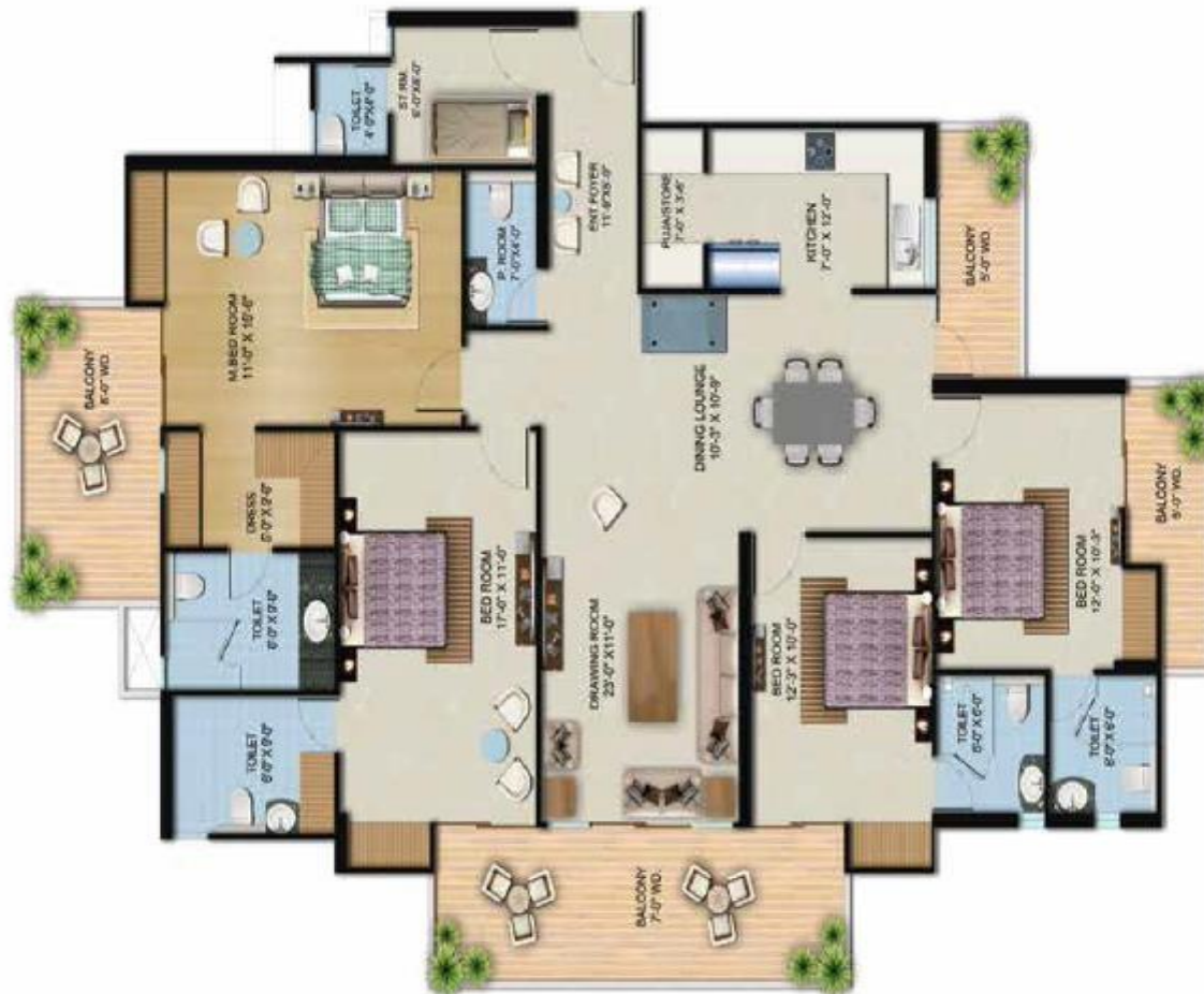
4BHK+ 4TOL.+ST. ROOM WITH TOILET + STORE + P.ROOM SUPER AREA - 2740 SQ.FT.