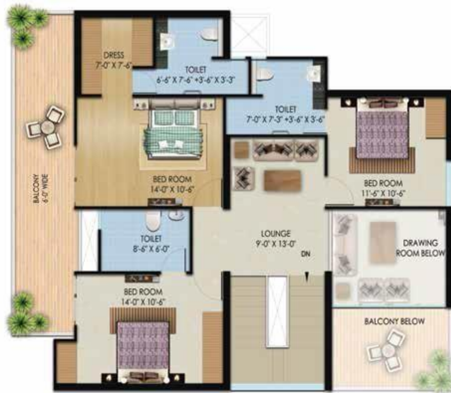
UPPER FLOOR PLAN 4BHK+ 4TOI.+SERVANT ROOM (DUPLEX) SUPER AREA - 3520 SQ.FT.