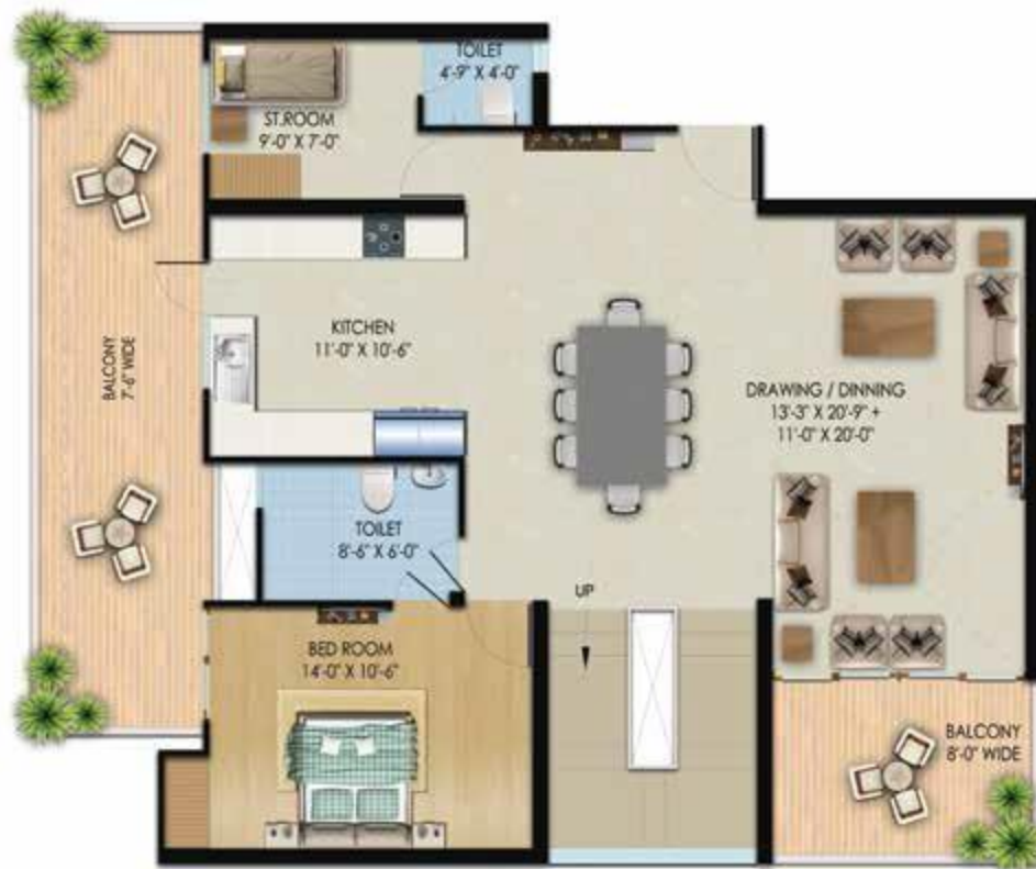
LOWER FLOOR PLAN 4BHK+ 4TOI.+SERVANT ROOM (DUPLEX) SUPER AREA - 3520 SQ.FT.