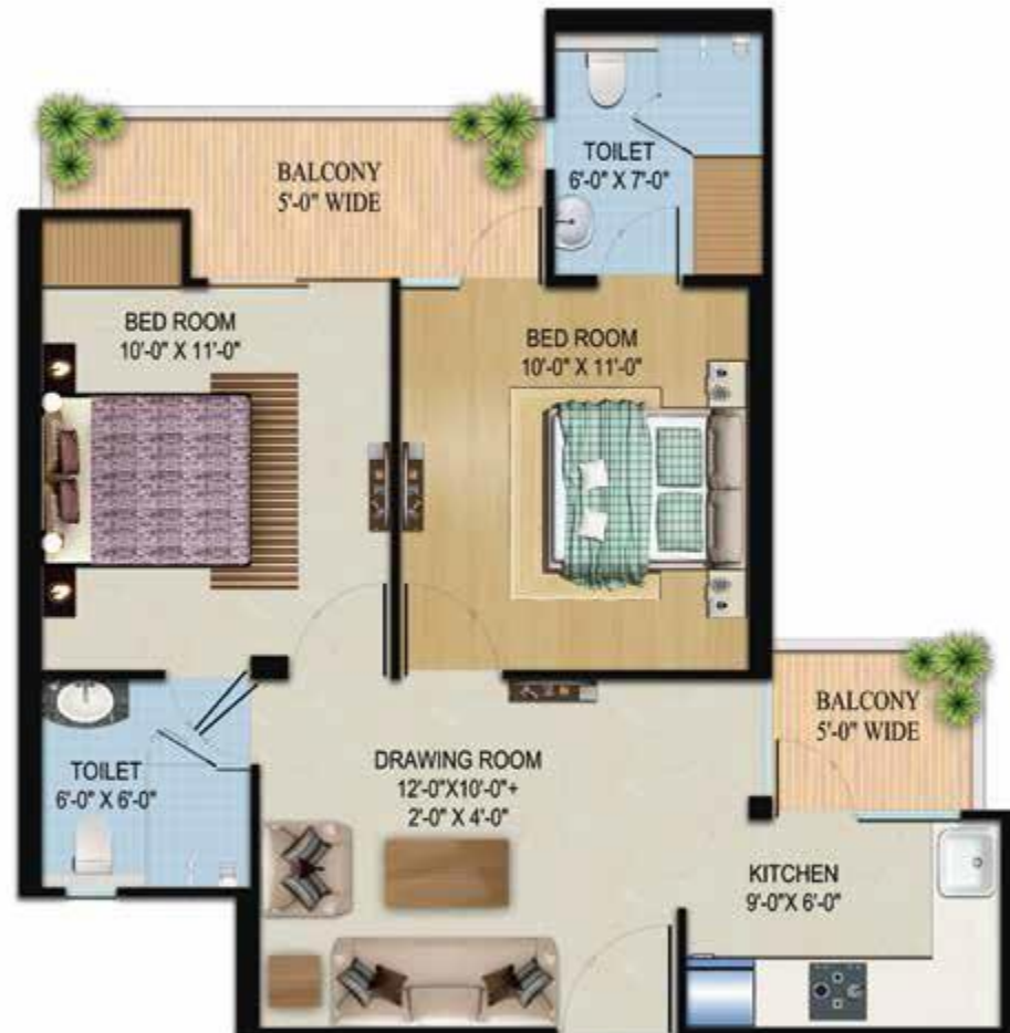
2BHK+ 2TOILET SUPER AREA - 860 SQ.FT.