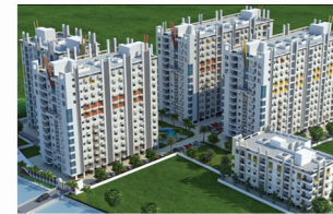
Green Heights(Rajarhat, Kolkata)

LOHARUKA has its own customer base that has shown a huge belief in the brand and due to their support today we have reached to the place we dreamed of. LOHARUKA is engaged in providing homes to the endless families, who aspire for their dream home becoming a reality one day, along with modern lifestyle amenities. LOHARUKA has completed several landmark projects in Kolkata and Pune, and currently lined up with significant projects in different part of Kolkata, Pune and Bengaluru.