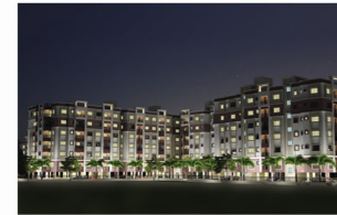
Green Oasis(Kaikhali, Kolkata)