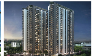
Solaris(Banerghatta Main Road,Bengaluru)