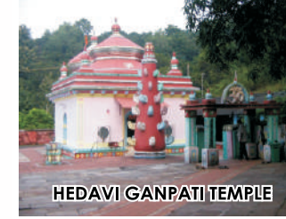
HEDAVI GANPATI TEMPLE