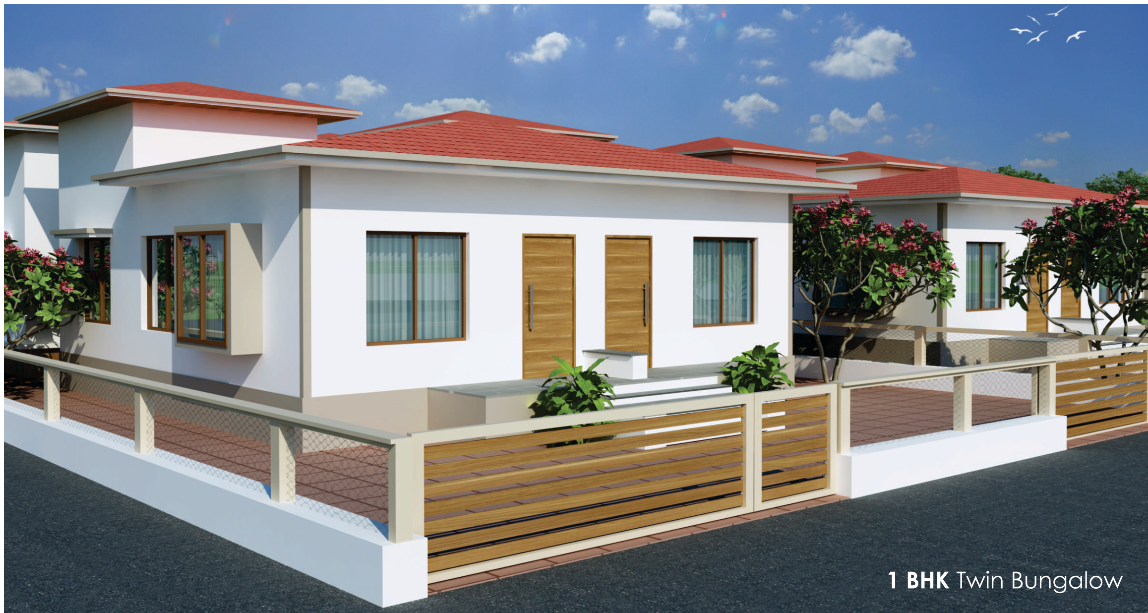
1 BHK Twin Bungalow