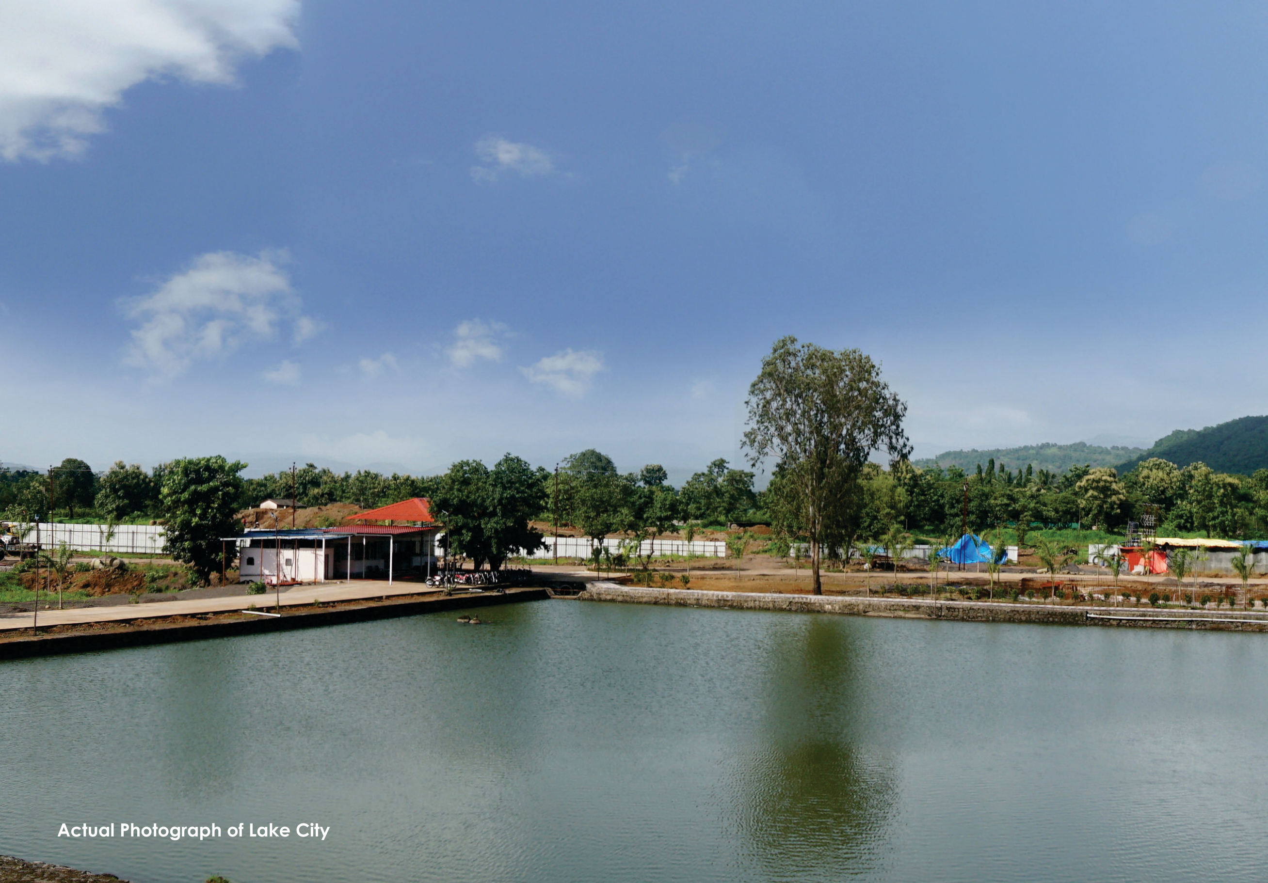
Actual Photograph of Lake City