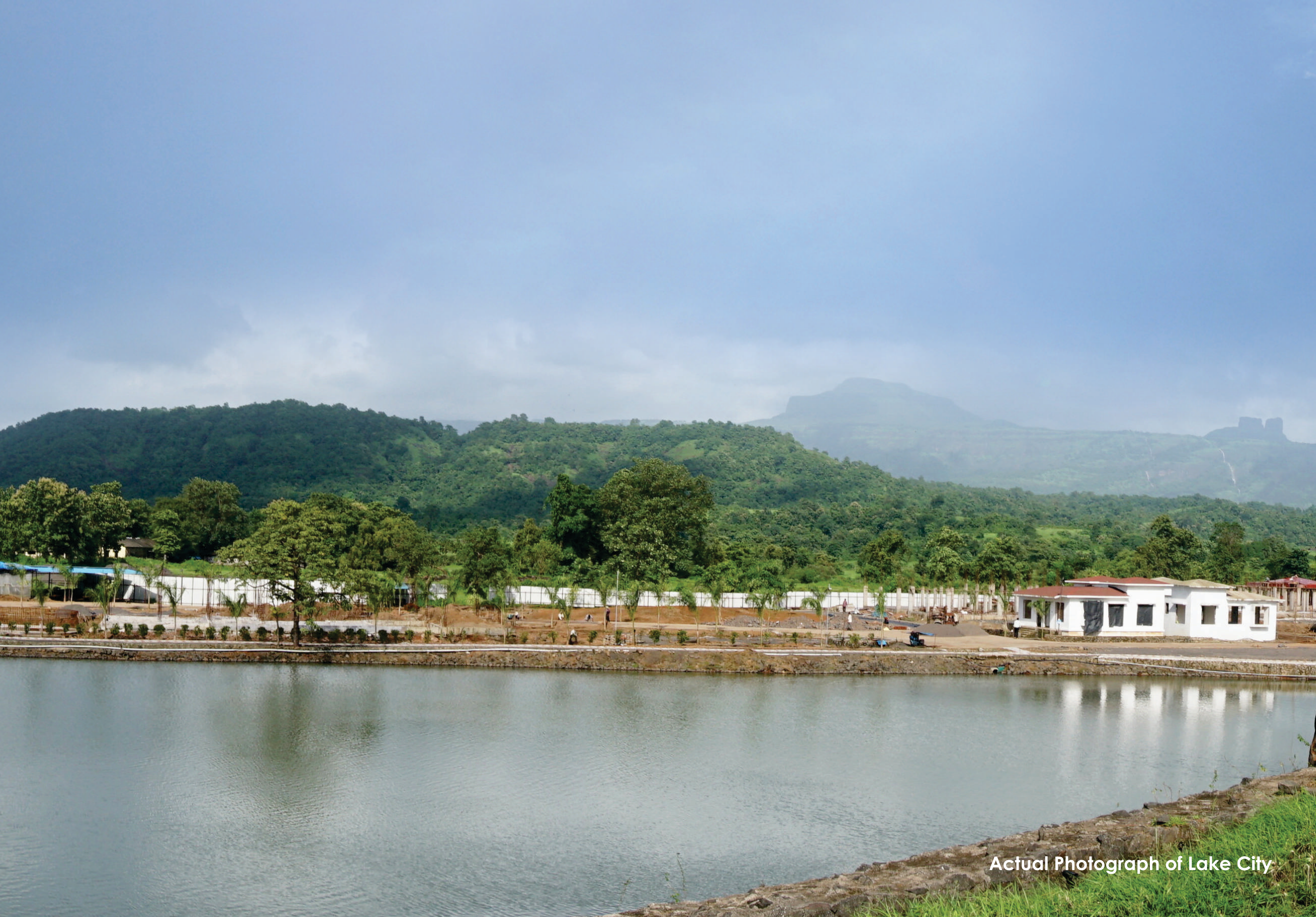
Actual Photograph of Lake City