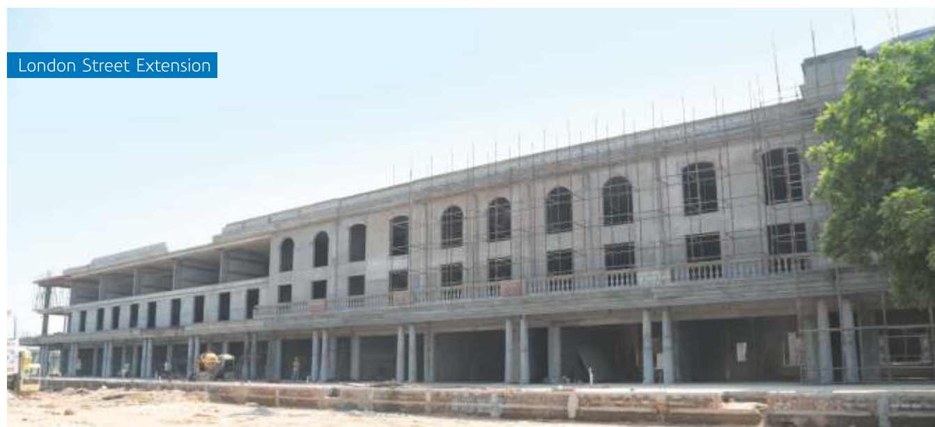
London Street Extension