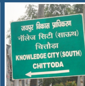
Actual Site Pictures