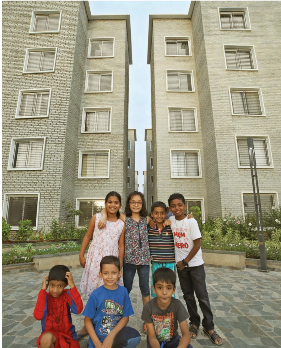
*All photos shot at Nandi Citadel