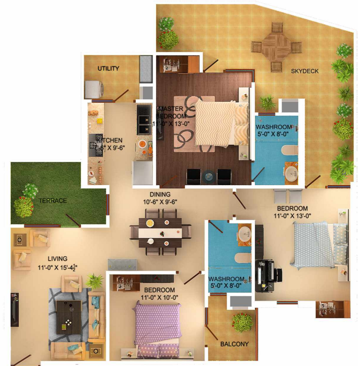
3 BHK WITH SKY DECK UNIT PLAN (1485 SQ. FT)