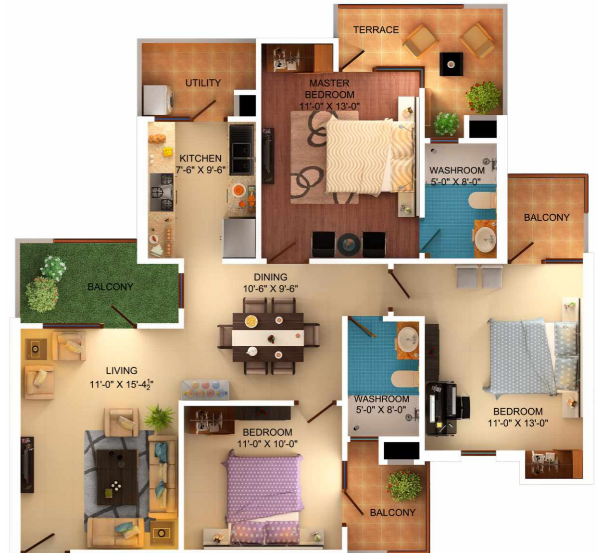
3 BHK UNIT PLAN (1485 SQ. FT)