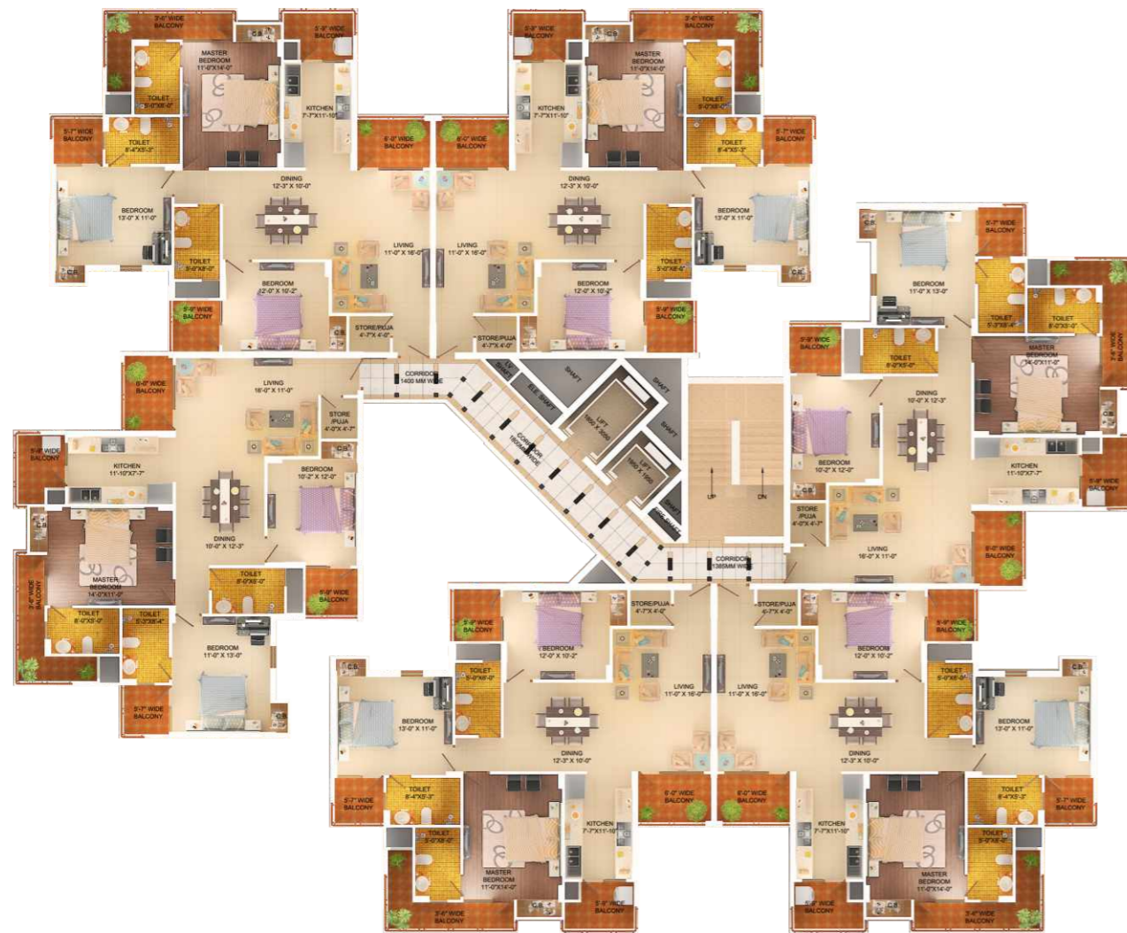
3B+3T CLUSTER PLAN (1705 SQ. FT.)