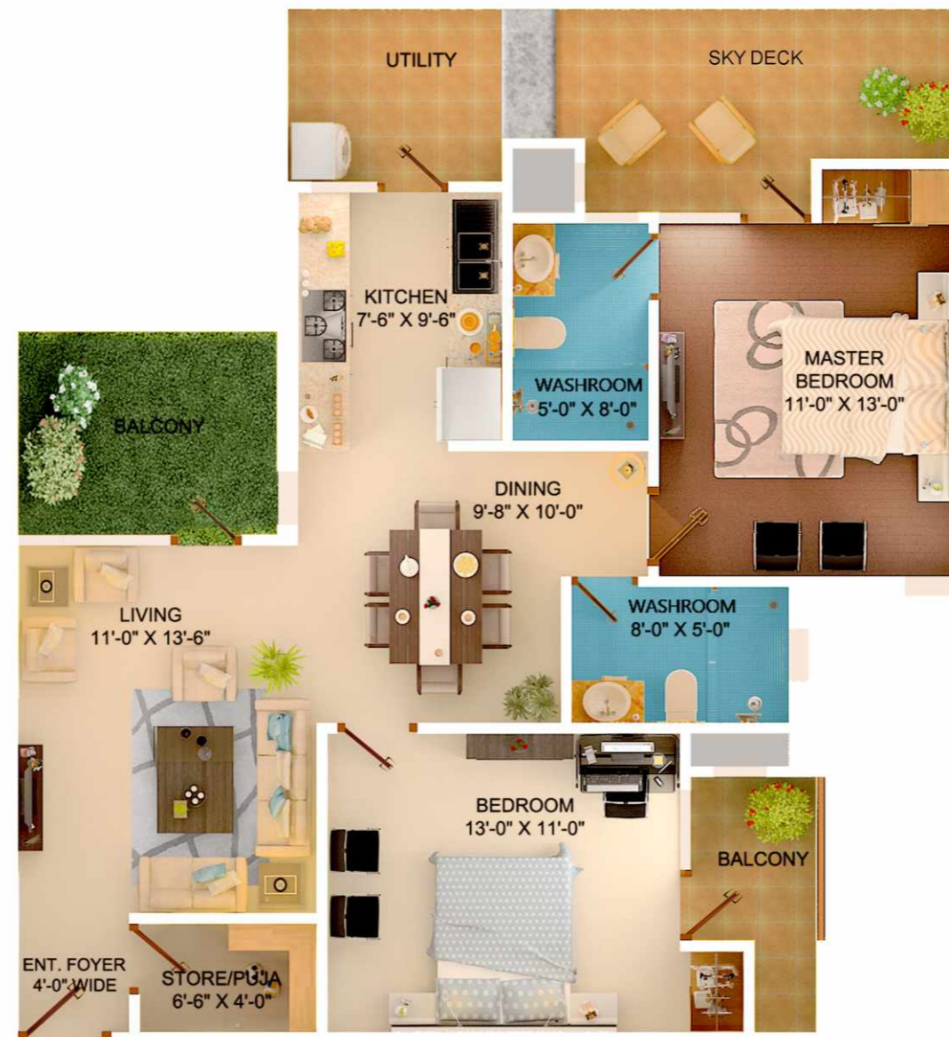
2 BHK WITH SKY DECK UNIT PLAN (1310 SQ. FT)