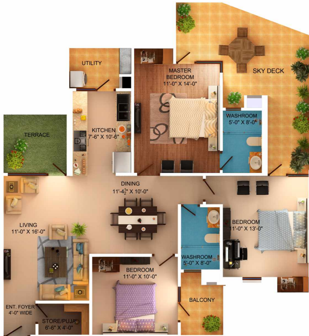
3 BHK WITH SKY DECK UNIT PLAN (1590 SQ. FT)