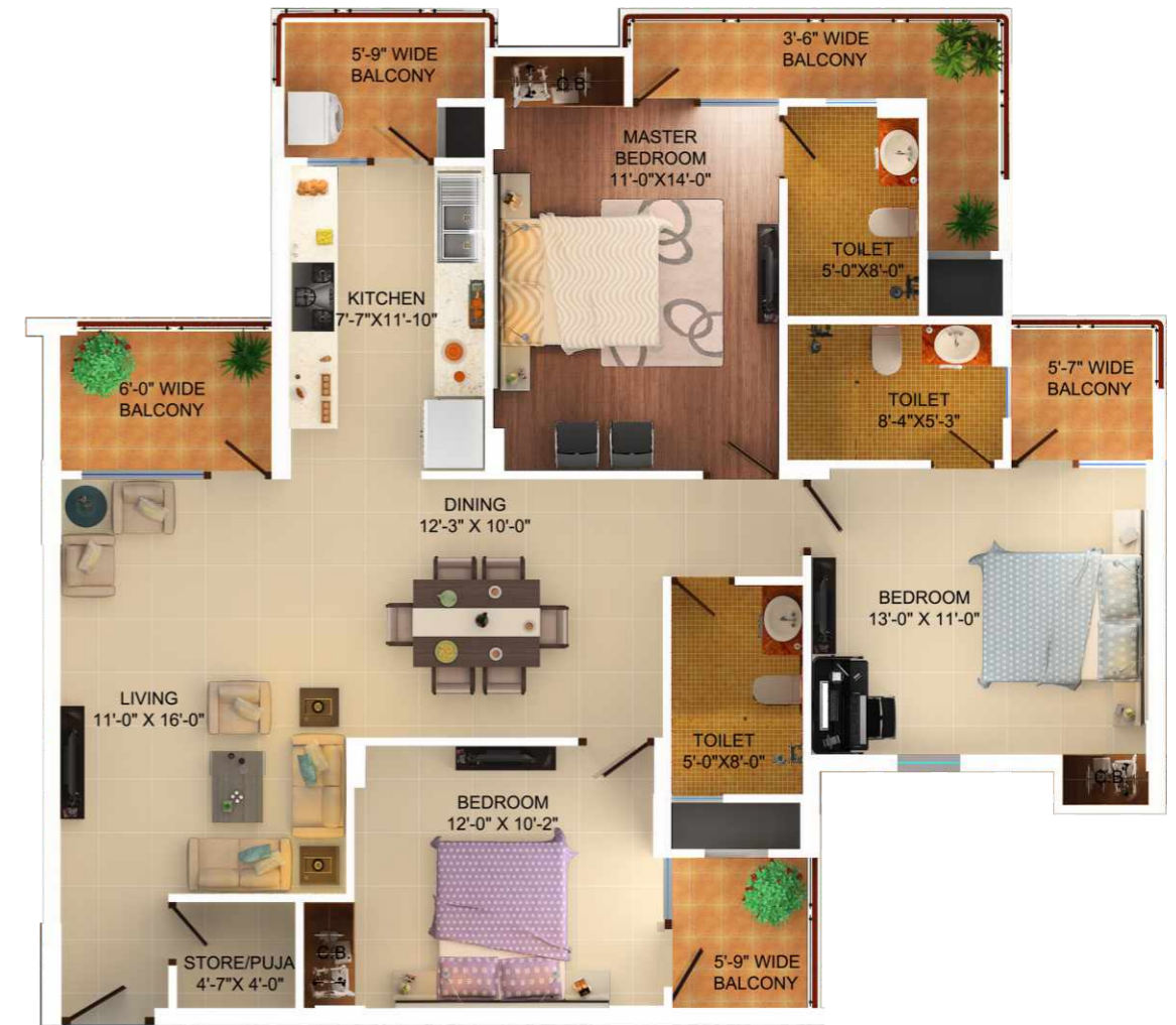
3B+3T UNIT PLAN (1705 SQ. FT.)