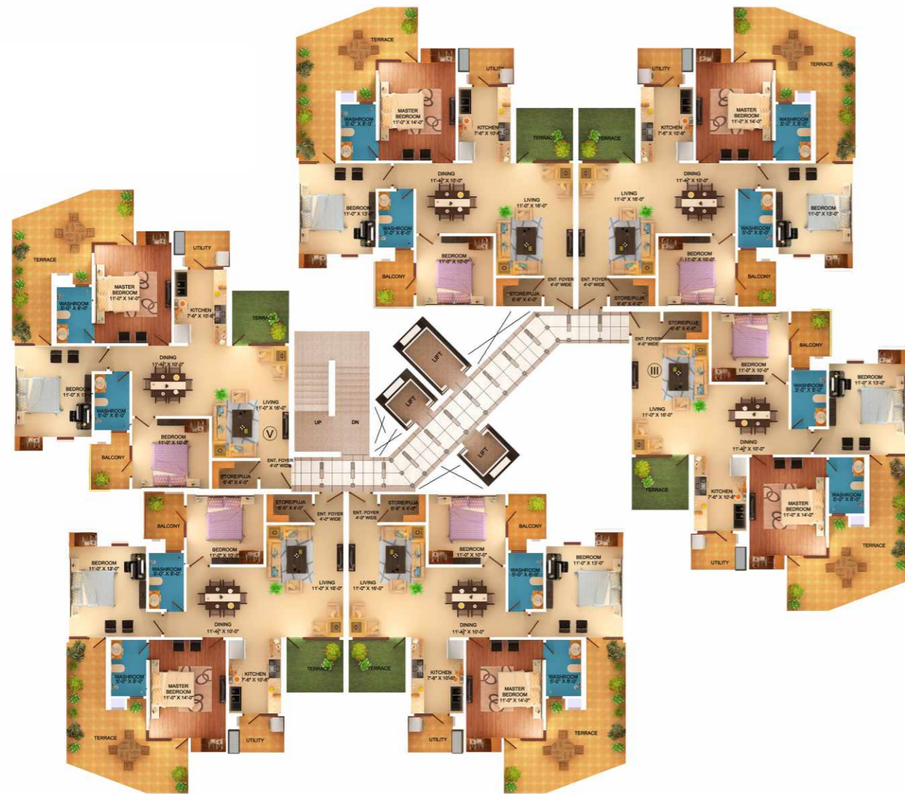
3 BHK CLUSTER PLAN (1590 SQ. FT)