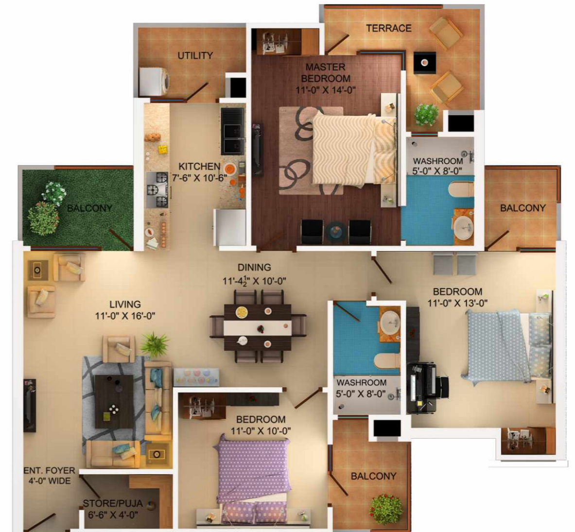
3 BHK UNIT PLAN (1590 SQ. FT)