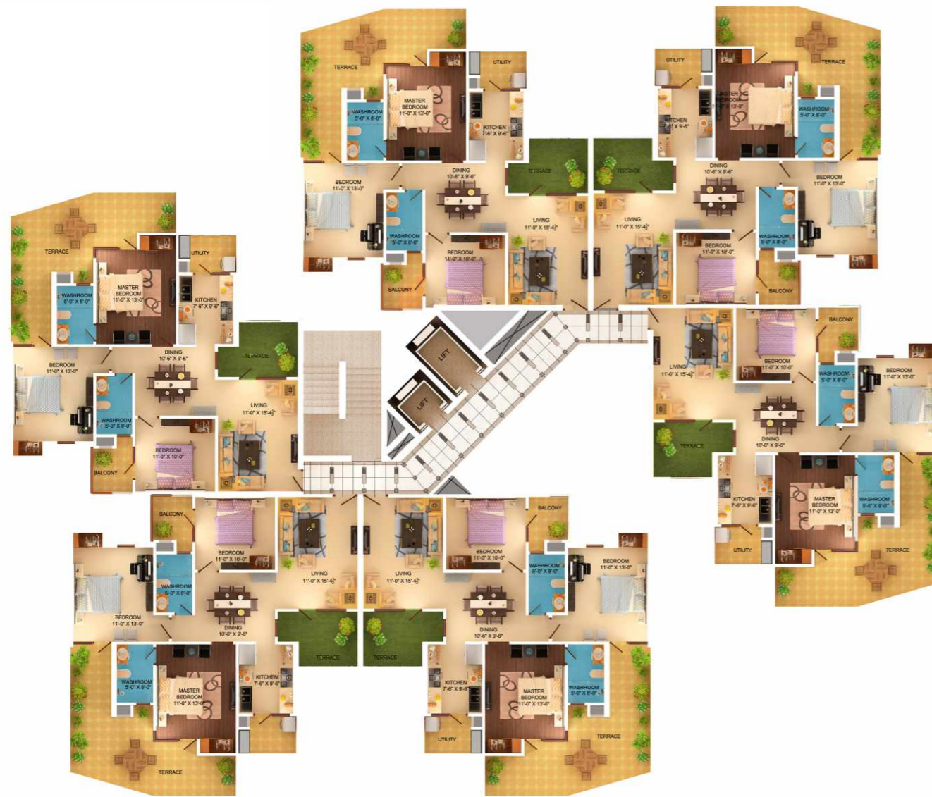
3 BHK CLUSTER PLAN (1485 SQ. FT)