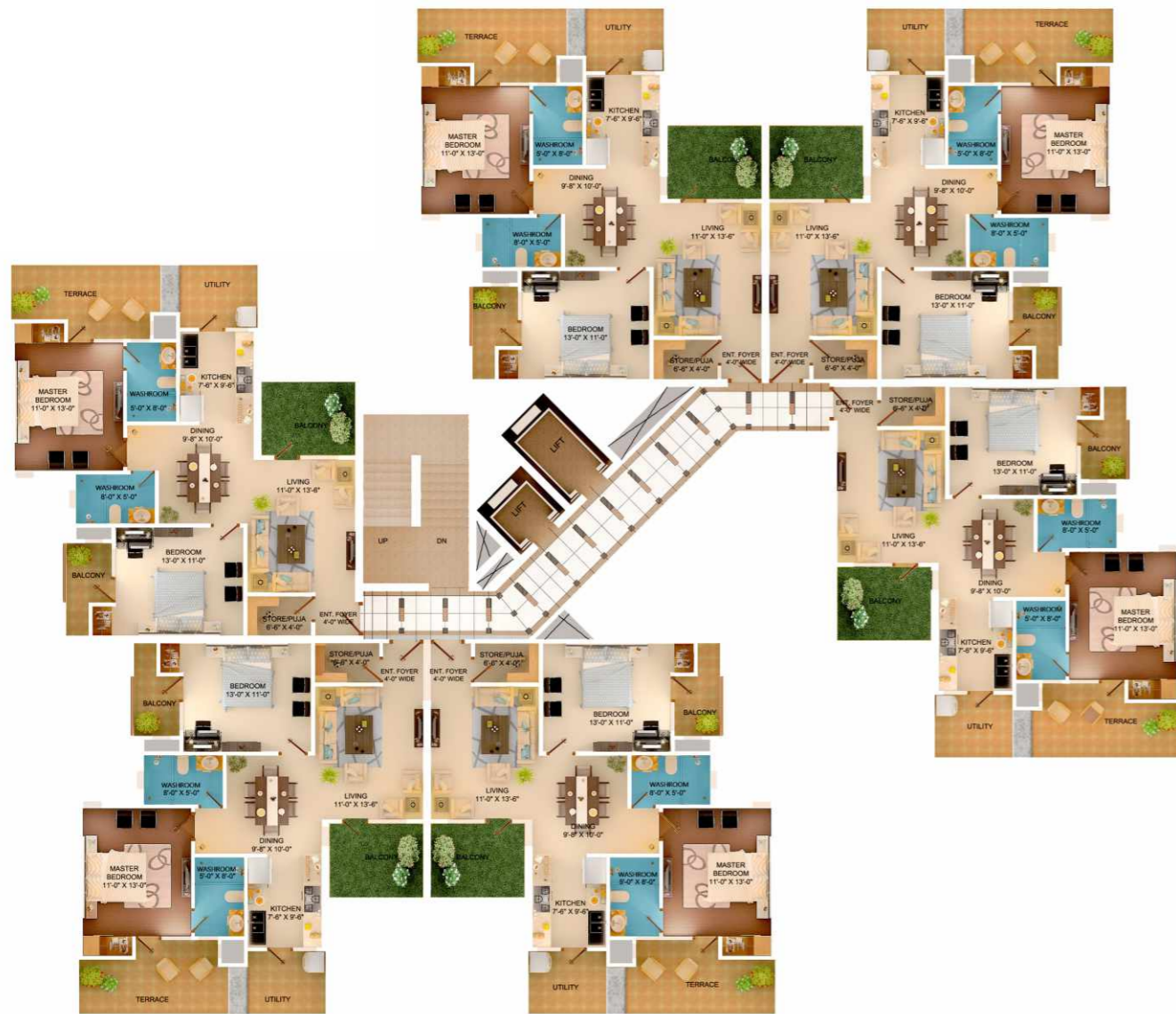
2 BHK CLUSTER PLAN (1310 SQ. FT)