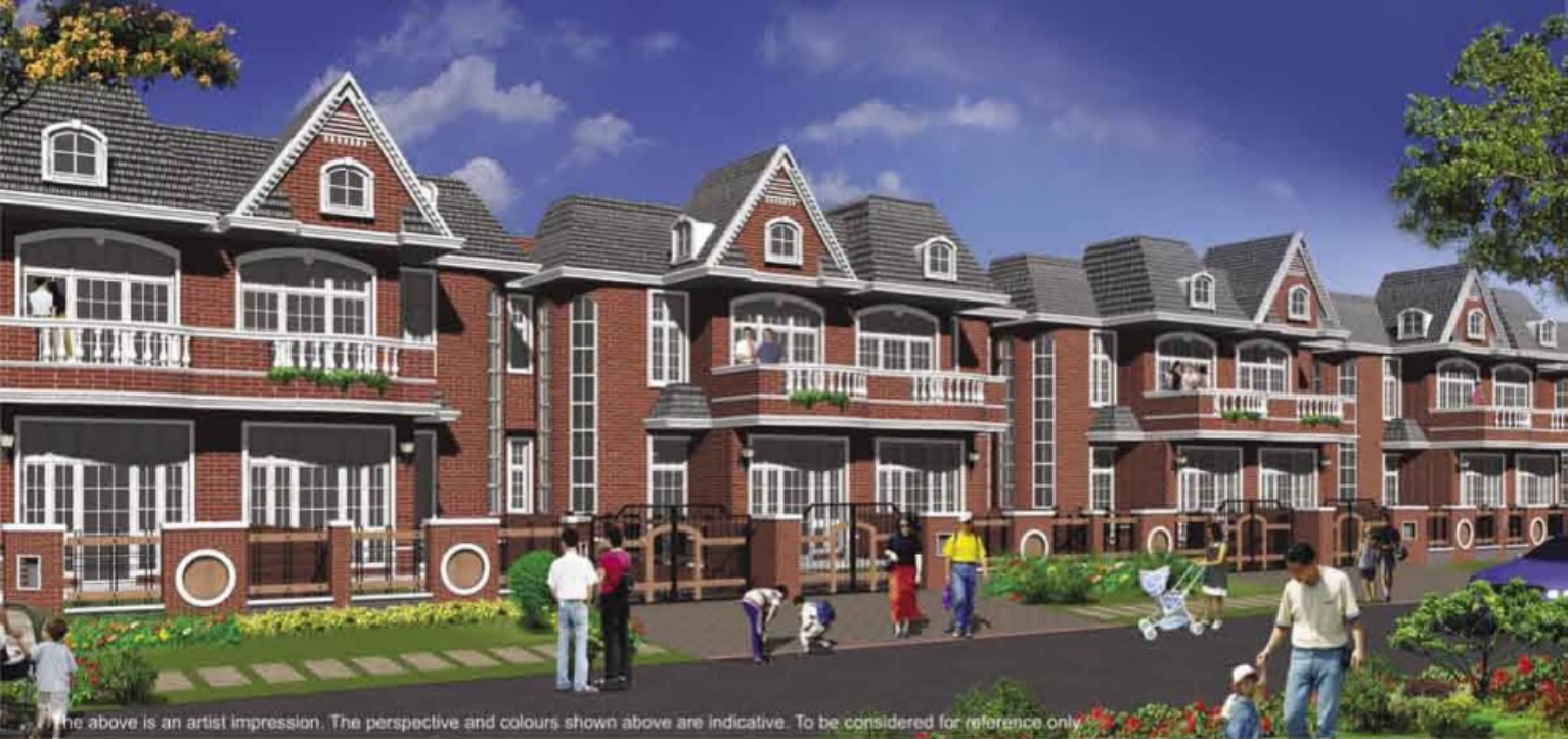
The above is an artist impression. The perspective and colours shown above are indicative. To be considered for reference only.

When Eldeco launched Eldeco Mansionz in Gurgaon a few years ago, it came as a breath of fresh air in elegant villa living. Today, it has emerged as a landmark project in independent villa lifestyle. Now, Eldeco brings the same villa splendour to Kanpur, for the very first time. An exclusive new address designed especially for Kanpur's elite.