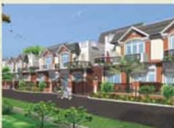
Eldeco Estate One G.T. Karnal Road, Panipat