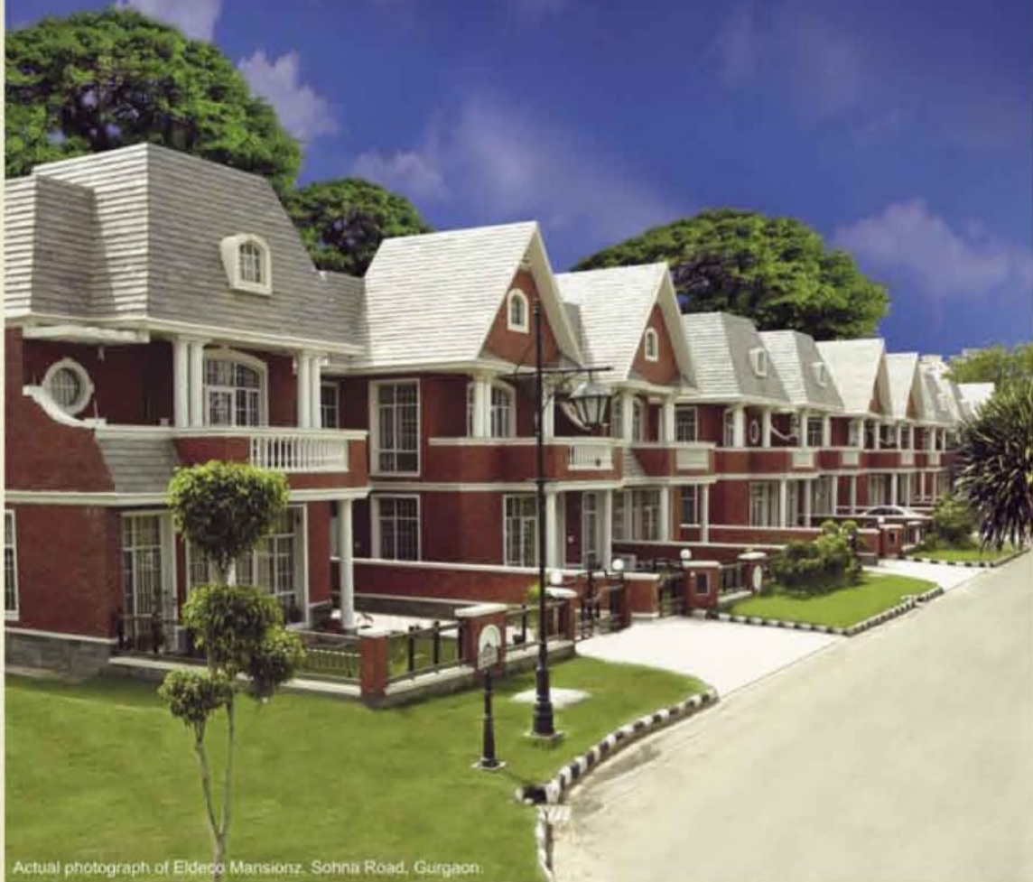
Actual photograph of Eldeco Mansionz, Sohna Road, Gurgaon.

Kanpur's elite now have an exclusive new address.