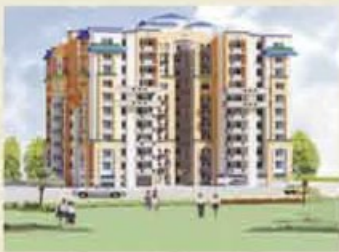
Eldeco Garden Estate Raipurva, Kanpur