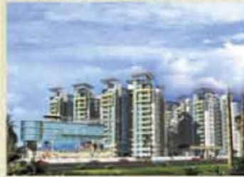
Eldeco Elegance Gomti Nagar, Lucknow