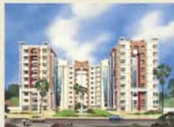
Eldeco Park View Sitapur Road, Lucknow