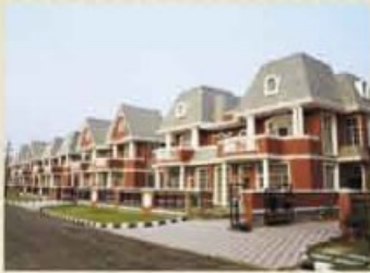
Eldeco Mansionz Sohna Road, Gurgaon