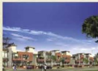
Eldeco County G.T. Karnal Road, Sonapat