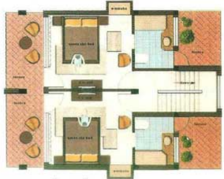
Cottage First Floor