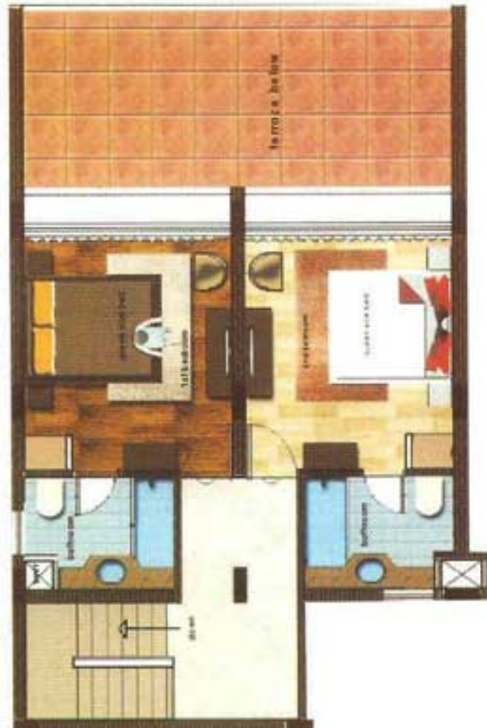
Duplex Upper Floor