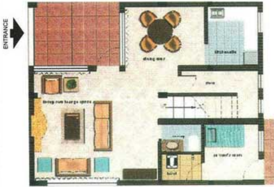
Cottage Ground Floor