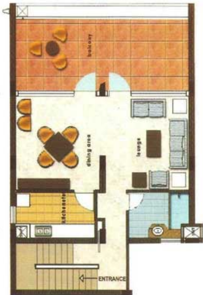
Duplex Lower Floor