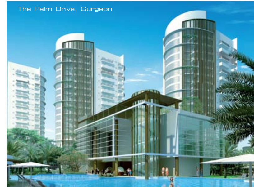
The Palm Drive, Gurgaon

India's premier real estate and infrastructure development company, Emaar MGF has brought in one of the largest FDI in the Indian real estate sector and is engaged in pan-India projects in the Residential, Commercial; IT Parks & SEZs, Retail, Hospitality, Healthcare and Education sectors.