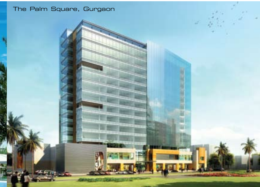
The Palm Square, Gurgaon