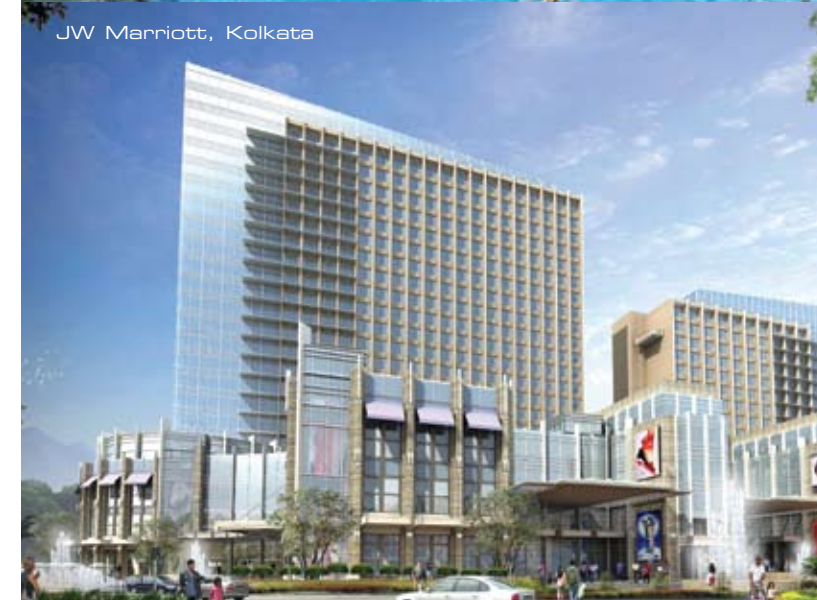
JW Marriott, Kolkata