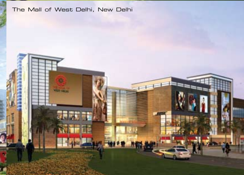
The Mall of West Delhi, New Delhi