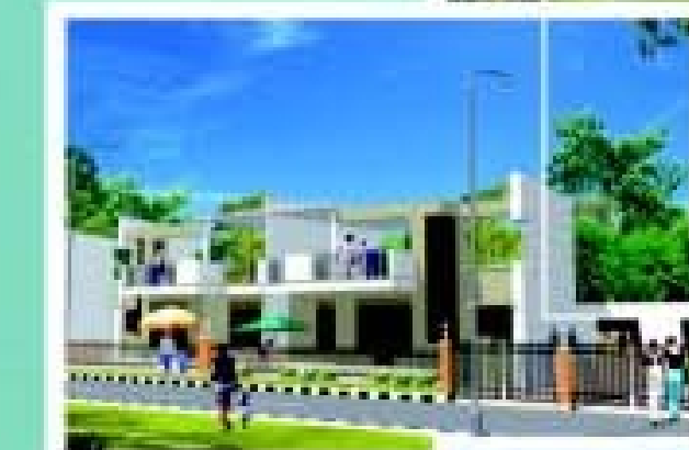
Divine Country Homes