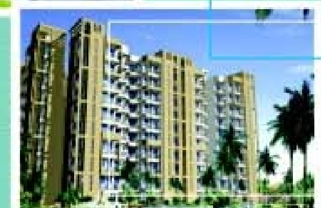
Divine Luxury Apartments