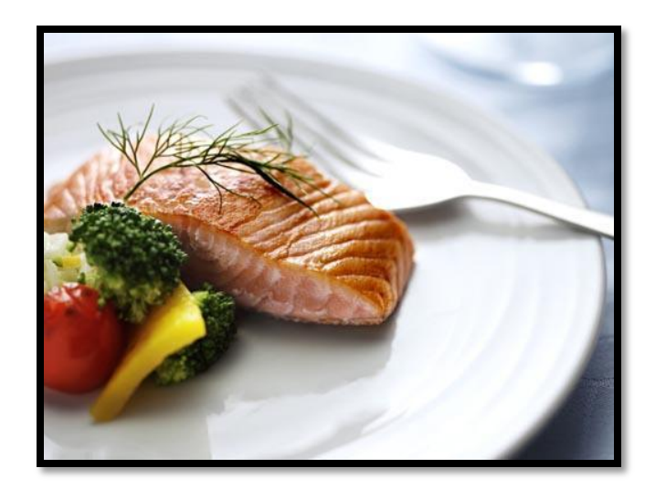
Fine Dining Restaurant