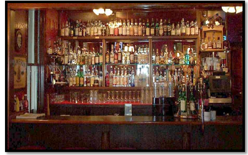
Bar / Pub