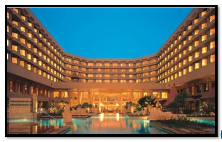
Seven Star Hotel