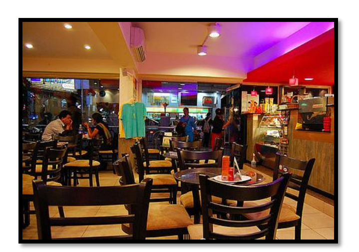
24x7 Coffee Shop