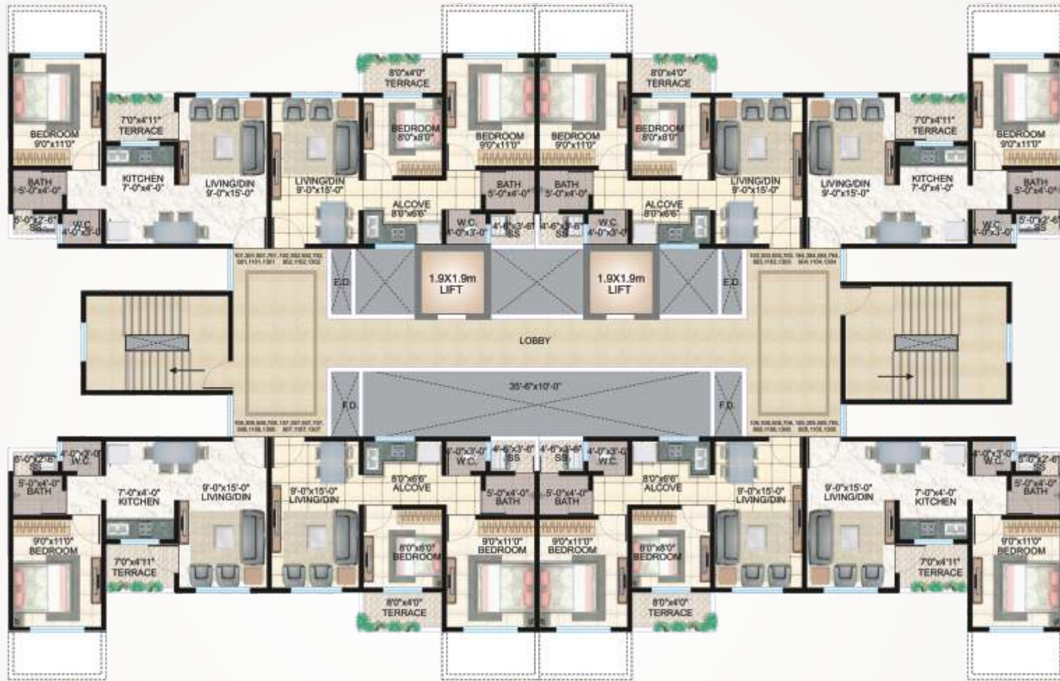
TYPE B - 8 UNITS