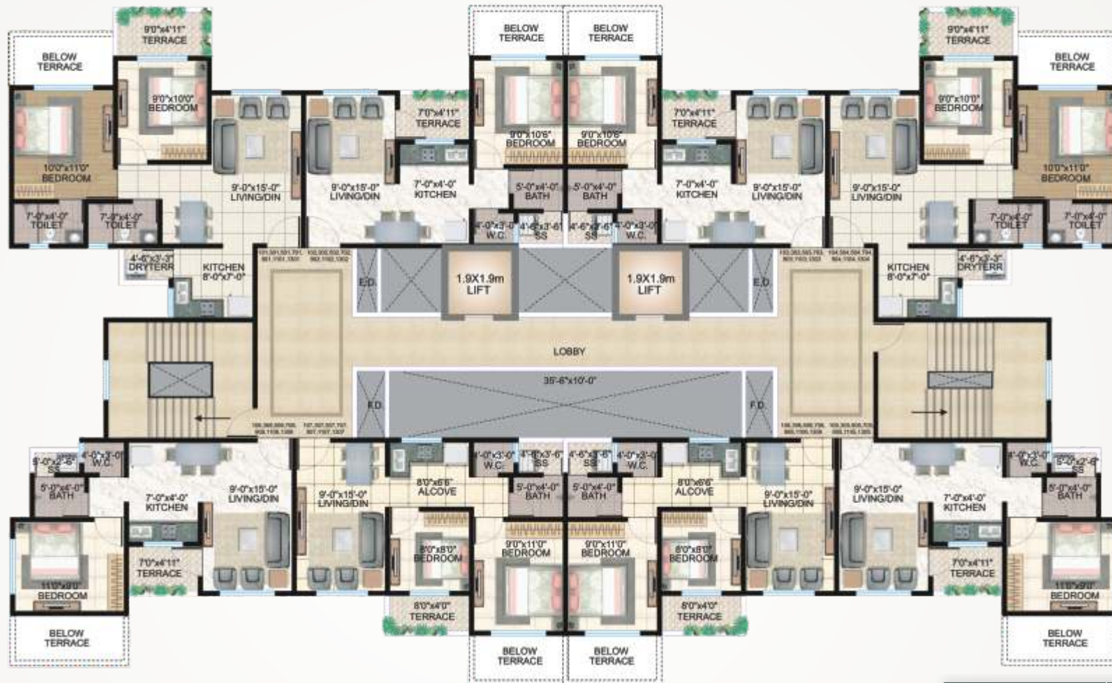
TYPE A - 8 UNITS