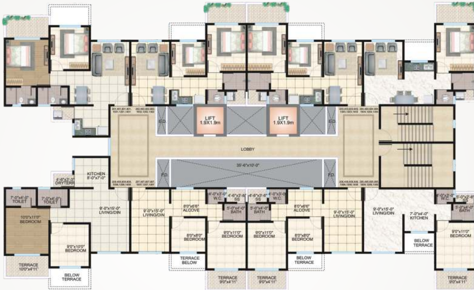
TYPE D - 8 UNITS