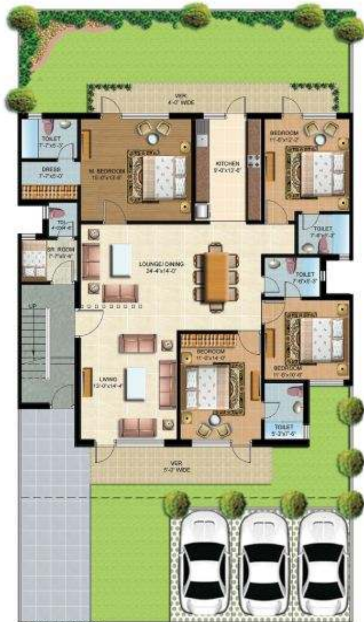
GROUND FLOOR PLAN SALEABLE AREA: 2200 Sq.Ft.