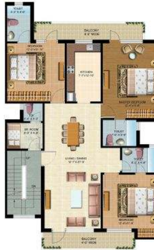
TYPICAL FLOOR PLAN (FIRST & SECOND) SALEABLE AREA/ FLOOR : 1725 Sq.Ft.