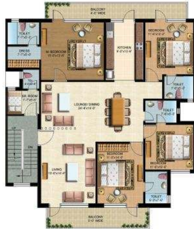
TYPICAL FLOOR PLAN (FIRST & SECOND FLOOR) SALEABLE AREA/ FLOOR : 2200 Sq.Ft.