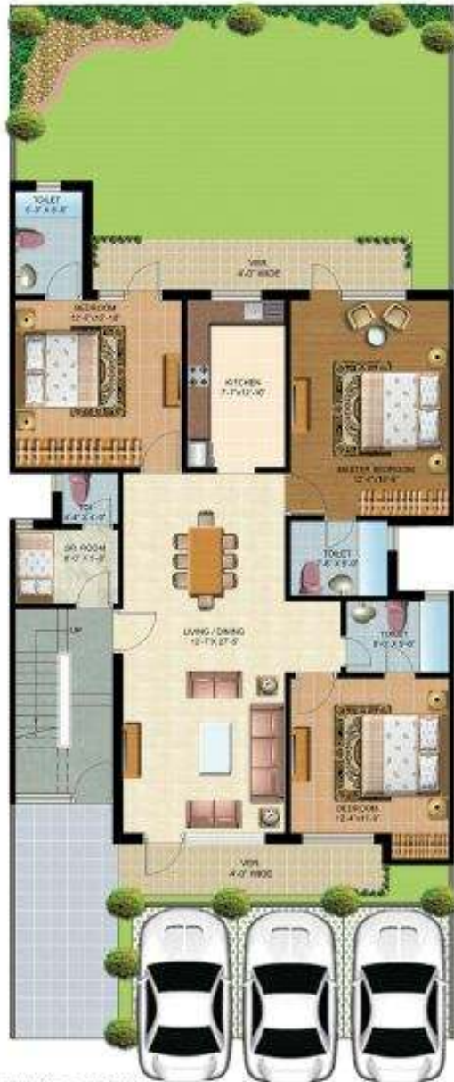
GROUND FLOOR PLAN SALEABLE AREA : 1725 Sq.Ft.